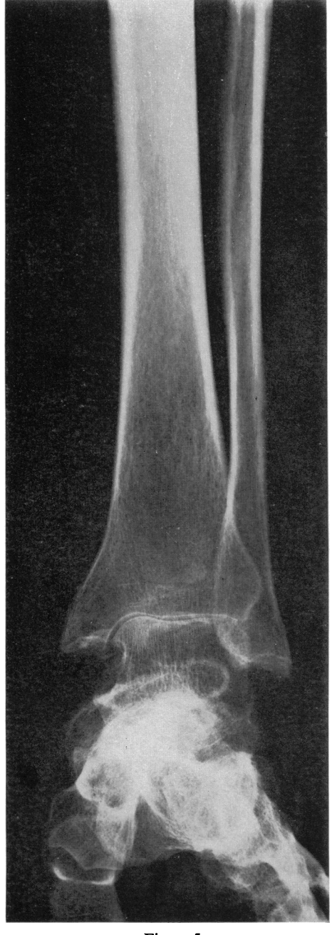
Figure 5. Radiograph of the left ankle region.