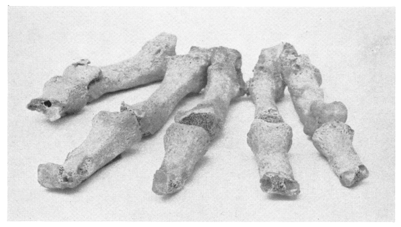
Figure 1. Right hand showing cupping of metacarpals and phalanges, at and around the joint surfaces.