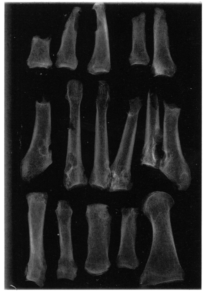
Figure 6. Radiograph of isolated metacarpals, metatarsals and phalanges.