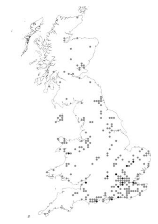
Fig. 3. Reported distribution of candidate mosquito vectors of TAHV. Includes reported distribution of all candidate mosquito vectors of TAHV: Ae. vexans is represented by black dots, as this is considered, in Europe, to be the principal vector. All other species ( Oc. cantans , Oc. caspius , Ae. cinereus , Oc. dorsalis , Oc. annulipes and Cs. annulata ) are represented in grey.

There have been sporadic reports of Aedes vexans, and few historical reports of Oc. sticticus and Cx. modestus. Months of activity, from January (1) to December (12), in parentheses A, Adults; H, hibernating adults; L, larvae.