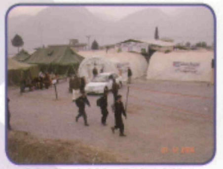
Cuban Hospital, Muzaffarabad, Pakistan