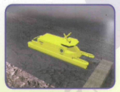
NorCat Floating Hospitals