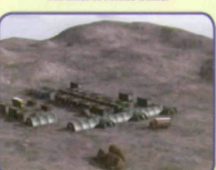
Norlense inflatable tents