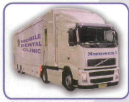
All kinds of clinics or hospitals in MultiSpace