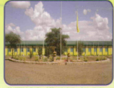
KATIKO Referral Hospital, Southern Sudan

Number One in the world within partly and turn key solutions incl. Transportation, Erection, Management, Training, Maintenance, Education, Administration. Storage, Out sourcing, Medivac, etc.