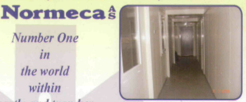
Inside MSF Hospital in Hattian Bala