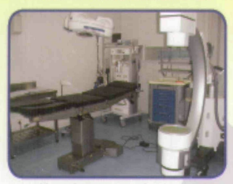
Inside OT in KATIKO Referral Hospital