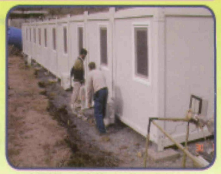
MSF Hospital, Hattian Bala, Pakistan