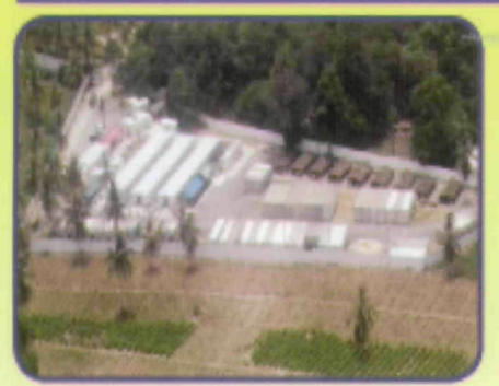
Thai Tsunami Victim Identification Centre