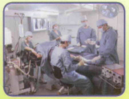
NorBase single and expandable containers