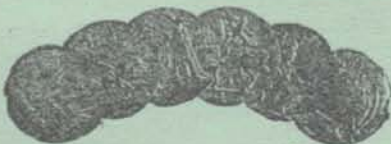
Gold Medal Allahabad 1910.

Paris 1900, Brussels 1910, Buenos Aires 1910.