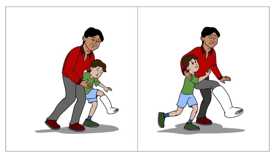
Figure 1. Example of a test item. The corresponding prompt was either Señala el niño que ayuda al hombre ('Point to the boy that is helping the man') or Señala el niño al que el hombre ayuda ('Point to the boy that the man is helping').