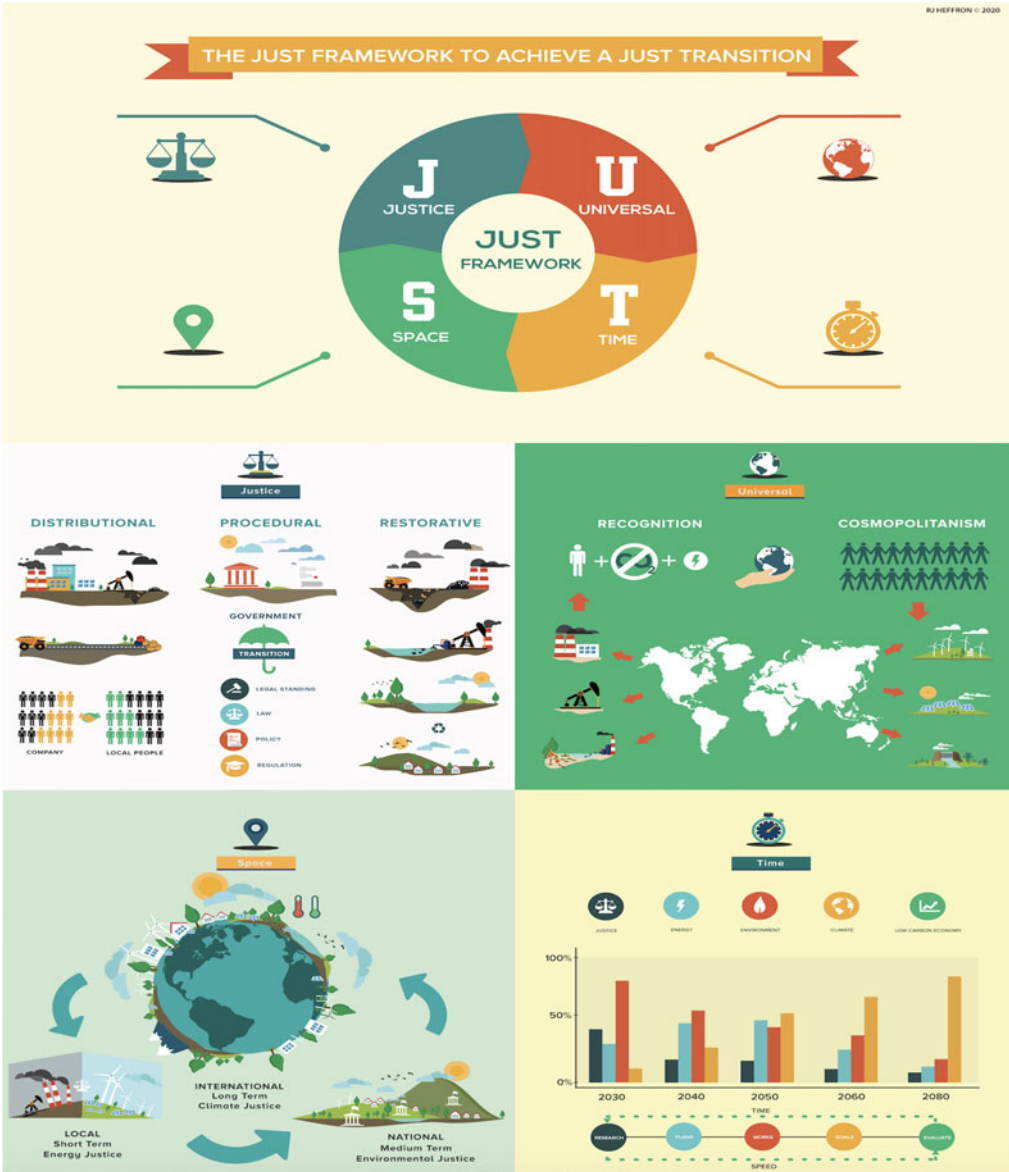
Figure 1 The JUST Framework Source: Qurbani, Heffron and Rifano (n 17) 357.

concerned with (also) tackling human rights abuses that occur throughout the stages of energy projects. The literature on energy justice is relevant not only because mining and the energy sectors more generally have always been important economic activities in which transnational corporations engage, notably in the developing and the least developed world, but also because the energy sector