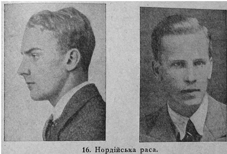
Figure 1. “Nordic Race.” Iendyk, Vstup do rasovoi budovy Ukrainy , 57.

urging them to “Be clean in body and spirit,” to “Piously cherish the racial type of your kin and the nature of your stock,” called upon them to “Marry timely, if you want your kin to inherit health,” and to “Aim at having at least four children” (Iendyk 1949, 329).