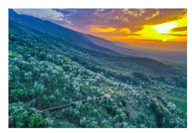
Restored Wild Fruit Forest landscape in Tianshan Mountains.

As a result of the impact of diseases and insect pests, climate change and human activities, Tianshan Wild Fruit Forest has experienced extensive degradation. To protect this important forest, the Ministry of Science and