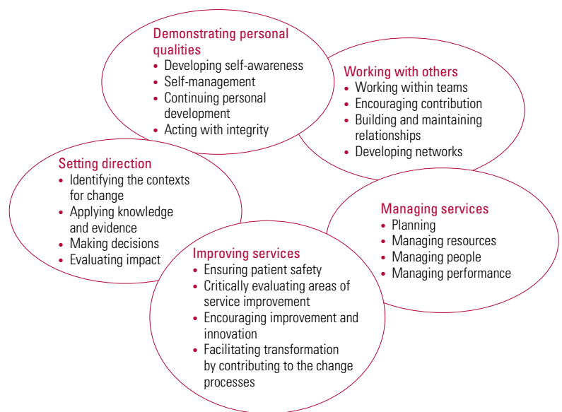
FIG 1 Medical Leadership Competency Framework (after NHS Institute for Innovation and Improvement 2010, with permission).

Given the current economic climate, there is a need for clinical services to be delivered in a fundamentally different way so as to improve productivity and efficiency. The NHS is looking