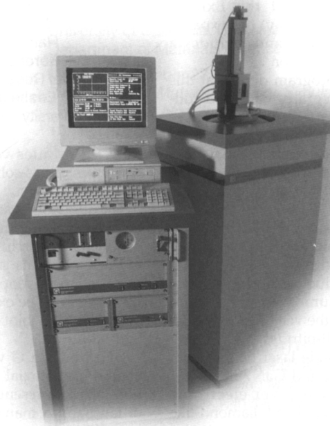
Magnetic Property Measurement System