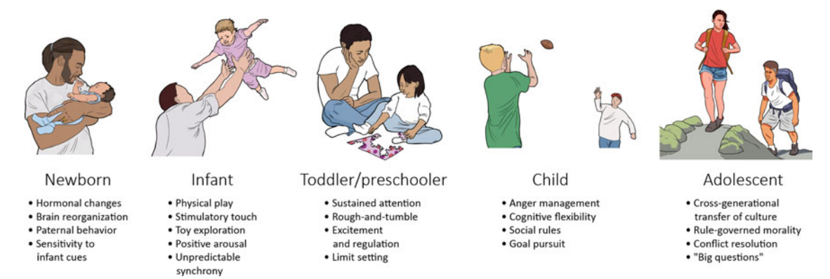
Figure 2. Father contribution to child resilience across developmental stages.

aforementioned features of high arousal, physicality, anger management, guided participation in daily living skills, adventure, exploration, and abstract expansion, typical of the paternal style, appear in distinct ways at each developmental stage. Like mothers, fathers may be more or less adept at relating to children of a particular stage and while some fathers may take great pleasure in playing "rough-and-tumble" games with their toddlers in the park, others may be less physically skilled and may be better at initiating deep conversations with their adolescents. We discuss typical milestones in the father-specific parenting from newborn to adulthood along the father's unique support of plasticity, sociality, and meaning. This developmental progress of the father-specific resilience-promoting style is presented in Figure 2.