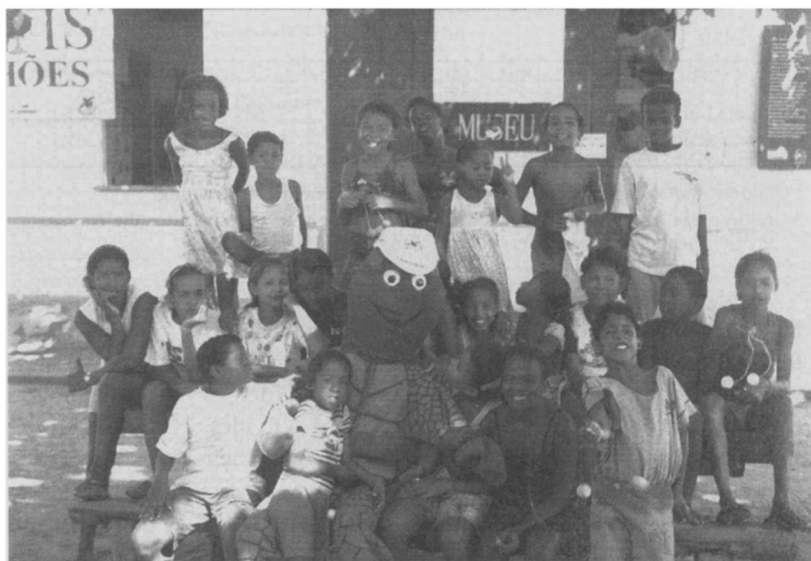
Plate 1 Mini-guides course. Through theatre presentations with a turtle character, the children taking the course learn about biology and conservation of sea turtles.

might occur. There are, so far, no records of turtles being disturbed in this way. Despite the fact that the beach is 14 km long, most tourists remain within a 2-km stretch, near the village. Resorts and houses have been constructed in such a way as to minimize their impact on turtles; for instance, beachfront illumination has been minimized and nearby lights have been screened, as recently recommended by Witherington & Martin (1996). In effect, there is little conflict between the needs of the turtles and the needs of the tourists.