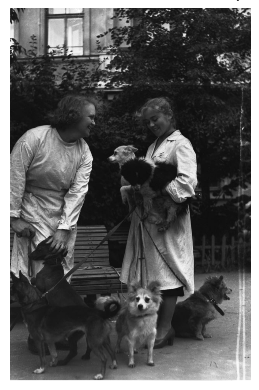
Figure 3. Space dogs interact with their handlers during a walk and photo-op.

during flight. So close to launch, they had few options to repair the problem and no time to physically inspect the cabin. Then Roman Baevsky, who had helped develop the equipment (the KMA-1), noticed through the porthole that the case holding the cuff on Strelka's