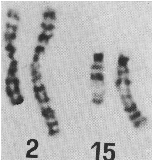
Fig. 2. Partial karyotype of a Giemsa banded metaphase of the mother of case 1: t(2;15)(q32\ q26) .

of chromosome 2 ( q32 \rightarrow q37 ), and monosomic for the telomeric part of the long arm of chromosome 15.