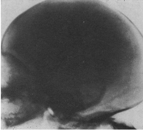
Fig. 1. Case 1: lateral view of the skull.

The chromosome formula in the mother was 46,XX,t(2;15)(q32\ q26) (see Fig. 2). Therefore, the proposita was trisomic for a large part of the long arm