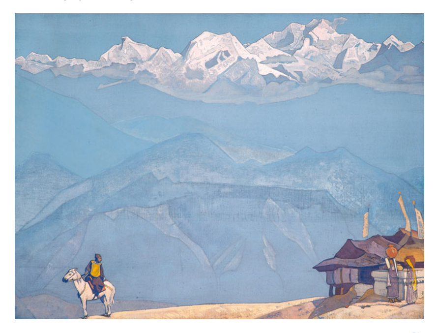
Figure 2. 'Remember' by Nicholas Roerich, 1924.<sup>51</sup>

presented as a single, violent force, in a narrative which otherwise rarely mentions the people living in the contemporary spaces that are described. Agyeya never explicitly identifies the men as Muslim. But by centring them within a cinematic image, this passage reduces contemporary Muslim politics in the region to an image of mindless violence.