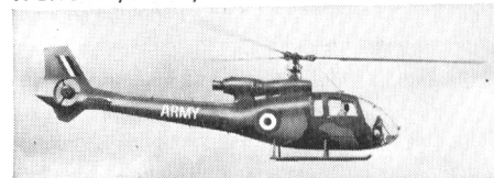
SA.341 British Army