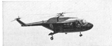
WG.13 French Navy