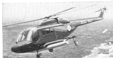
WG.13 Royal Navy