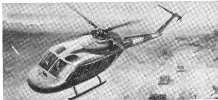
WG.13 British Army

These are the advanced helicopters that the British and French Governments have decided will equip the Armed Forces of their countries, in substantial numbers, in the next decade.