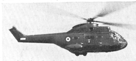
SA.330 French Army