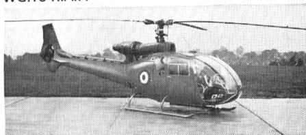
SA.341 French Army