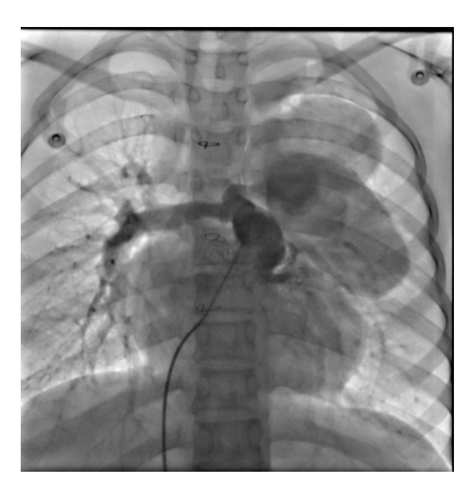
Figure 3. Pulmonary angiography showed significant regurgitation of the pulmonary valve.

Video). The pressures recorded in the right ventricle, main pulmonary artery, and left and right pulmonary arteries were 110/0, 100/0, 52/14, and 30/6, respectively (right ventricular systolic pressure/diastolic pressure). We speculate that septic pulmonary embolism led to the formation of the pseudoaneurysms of the pulmonary artery. Finally, considering the risks of intervention for arterial aneurysm closure, we plan to closely follow-up with CT imaging without closing the aneurysm. This case highlights the importance of monitoring for complications and regular follow-up in patients with CHD postoperatively.