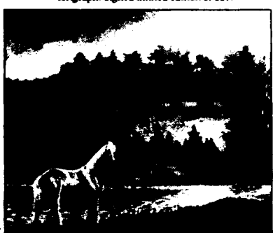
usch's Early Morning, original lithograph.