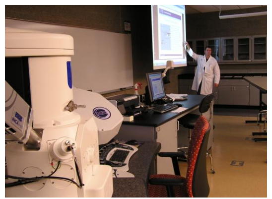
FIG. 2. The SEM facilities at Schoolcraft College.