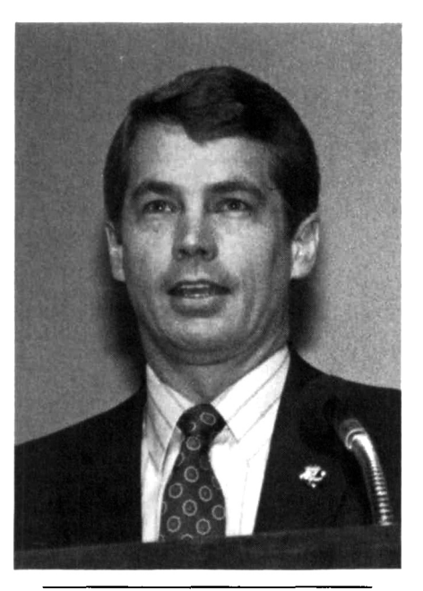
U.S. Representative David McCurdy (Oklahoma), a member of the House Science, Space and Technology Committee.

A DOD panel on superconducting research and development was formed in June 1987. The panel's report recommended continuing activities in low temperature superconductivity and supporting research in areas particular to DOD interests, such as the effect of ionizing radiation on the new materials. Significant interest from the Strategic Defense Initiative