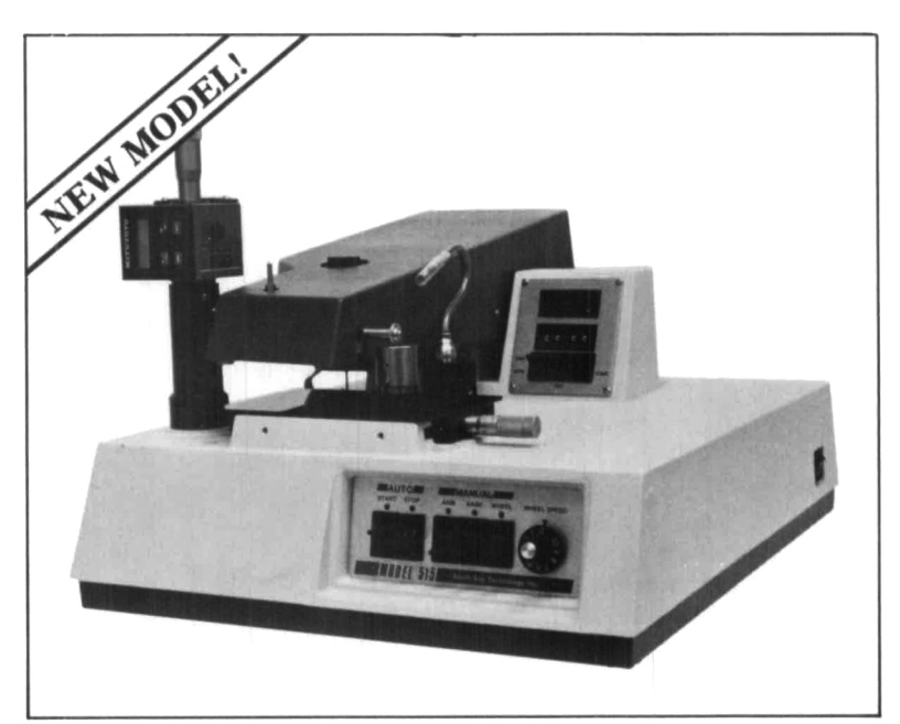
SBT MODEL 515 Precision Dimpling Instrument for TEM Specimen Preparation.

South Bay Technology has been providing the materials research community with superior sample preparation equipment for over 22 years. By designing and manufacturing our own equipment, we have built a reputation for uncompromising quality, precision and service. By listening to your needs, we have been able to meet your requirements for