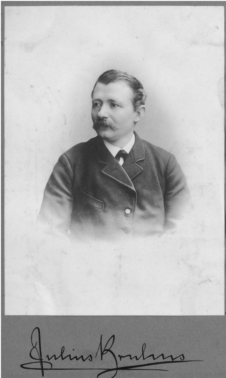
Figure 1. Julius Bruhns (Hamburg 1860–Offenbach 1927). Like several other German cigar-makers, Bruhns became a prominent social democrat. In 1921 he wrote his memoirs, Es klingt im Sturm ein altes Lied ( http://library.fes.de/pdf-files/netzquelle/a-58090.pdf ).