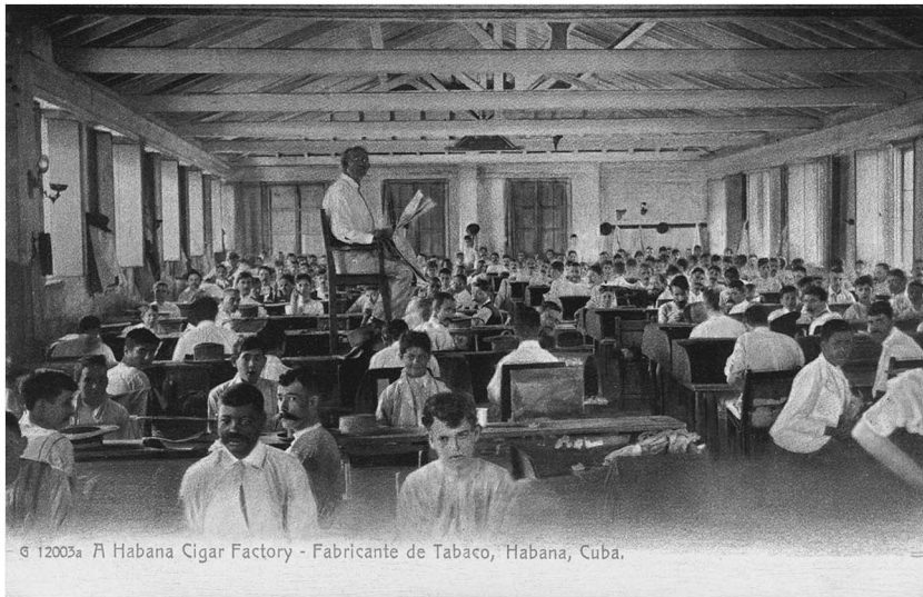
Figure 2. Interior of a cigar-factory in Havana (Cuba), c.1903. This postcard shows a lector , reading a newspaper to entertain his co-workers. The habit of “Reading” originated in Cuba around 1865 and became widespread in Germany as well.