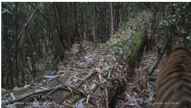
PLATE 1 Camera-trap photograph of Bengal tiger Panthera tigris tigris in Medog County (Fig. 1).

livestock and dogs frequently occurred throughout the area, as indicated by a high occupancy for anthropogenic events (Fig. 2, Supplementary Material 2).