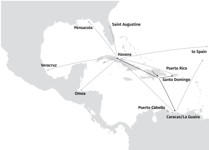
MAP 4.2 Flows of French war captives from Santo Domingo (in black) and during the war (in gray), 1793–95.

Africans and Afrodescendants caught in Saint-Domingue. It is worth noting that the individuals in the latter group had been emancipated by the French in 1793; by categorizing them as “slaves,” the Spanish authorities demonstrated their unwillingness to acknowledge those revolutionary measures. At the same time, the fate of the White captives was further associated with that of the (White) French refugees ( emigrados ), who arrived from Saint-Domingue, Martinique, and France before and during the war. Moreover, some of those caught during the conflict were not classified and treated as prisoners of war but were prosecuted for specific criminal acts and labeled as convicts. This group, too, was divided and managed along racial and class lines.