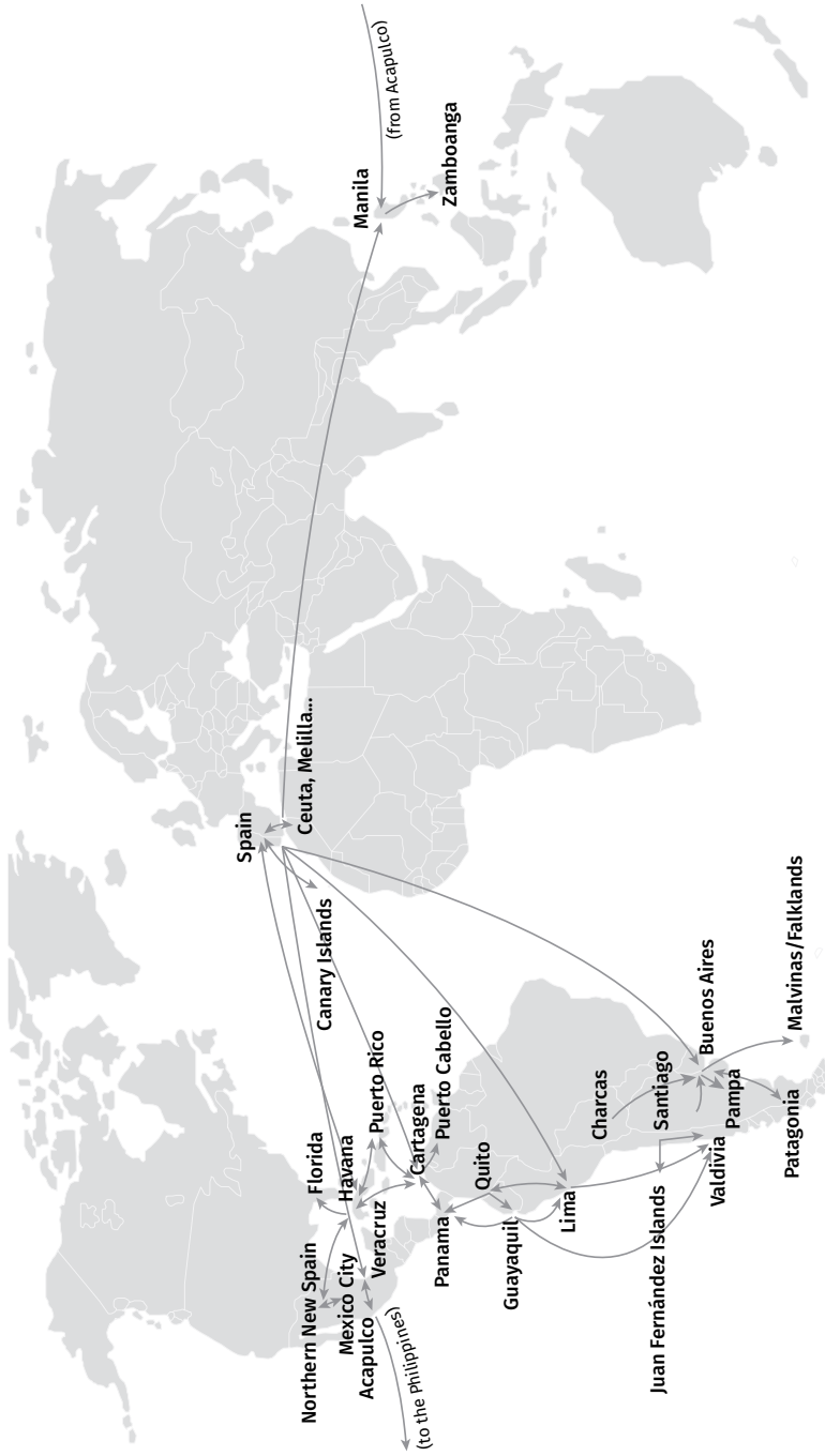
MAP 4.3 Network of punitive relocations to the presidios , Spanish monarchy, 1760s–1820s.