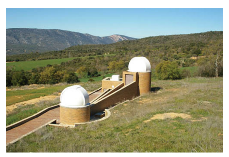
Figure 4. View of the two domes of the Telescopes Park.

The Telescopes Park is the outdoor section of the Universe Observing Center. This area is devoted to observing the sky during day and night. It consists of two buildings with astronomical domes (see Figure 4) and an area for setting up the COU's portable telescopes. The equipment of the Park consists of: