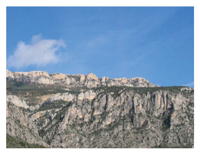
Figure 1. View of Montsec mountain range.

PAM is located in Montsec mountain range (see Fig. 1) in the North-East of Iberian Peninsula, around 180 km from Barcelona. Montsec is a calcareous mountain range more than 40 kilometers long, covering an area of 18,696 hectares divided between Aragon and Catalonia. PAM has two main parts: the observatory and the Universe Observing Center. The observatory is placed on the top of the mountain and the Universe Observing Center is placed in the Ager Valley in Montsec area.