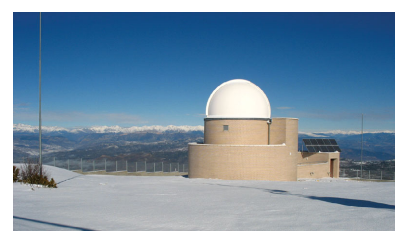
Figure 2. View of the Observatori Astronòmic del Montsec in winter.

The Observatori Astronòmic del Montsec (OAdM) is located on the top of the mountain (see Fig. 2), at 1570 meters above sea-level. It is placed in a small town called Sant Esteve de la Sarga (Pallars Jussa). This is the research part of the PAM project and basically this observatory is devoted to general astronomy research and Ph.D. practical lectures. The OAdM contains an 80cm telescope, called Joan Oro Telescope honoring this catalan scientist.