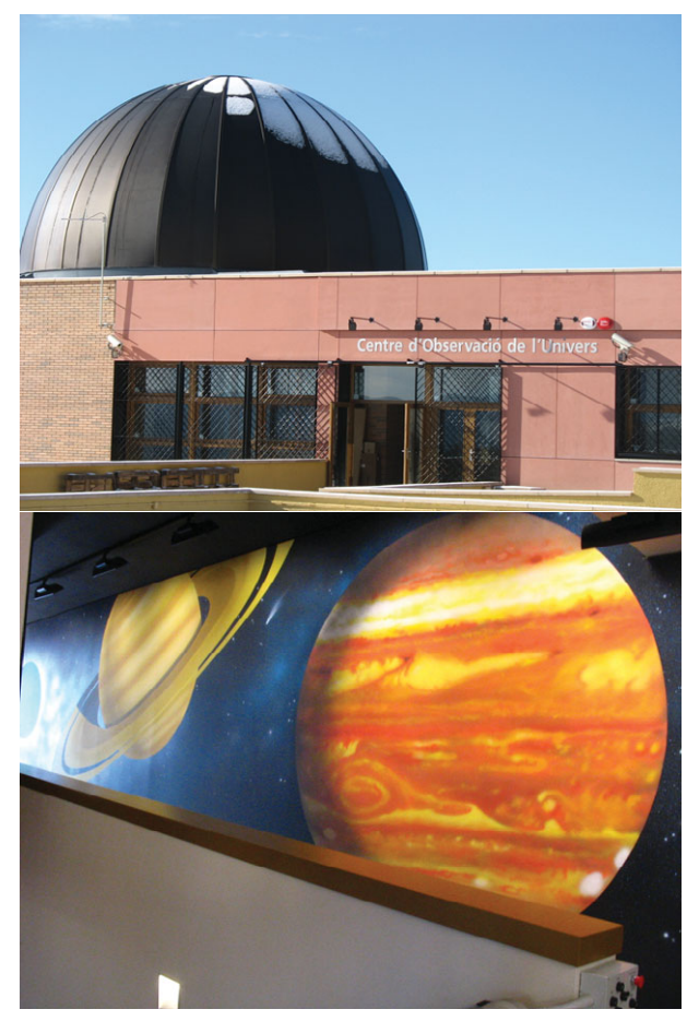
Figure 3. Top: General view of Centre d'Observacio de l'Univers. Bottom: The Solar System in the permanent exhibition.

The Central Building contains the reception and offices of the Center, the standard classroms, the computer classrooms and the Permanent Exhibition of this Center. This Central Building houses a permanent exhibition covering the main areas of interest of the COU: astronomy, obviously, but also the geology, fauna and flora of the Montsec region are given pride of place. The exhibition reproduces and analyses the different habitats in the Montsec region and gives an overview of its geological history, including all the huge transformations the Earth has gone through since it was formed. The astronomical section gives an overview of the main topics in Astronomy, from the Big Bang, the formation of galaxies and the evolution of stars and black holes through to the detection of other planets and our neighbours in the Solar System (see bottom image of Figure 3).