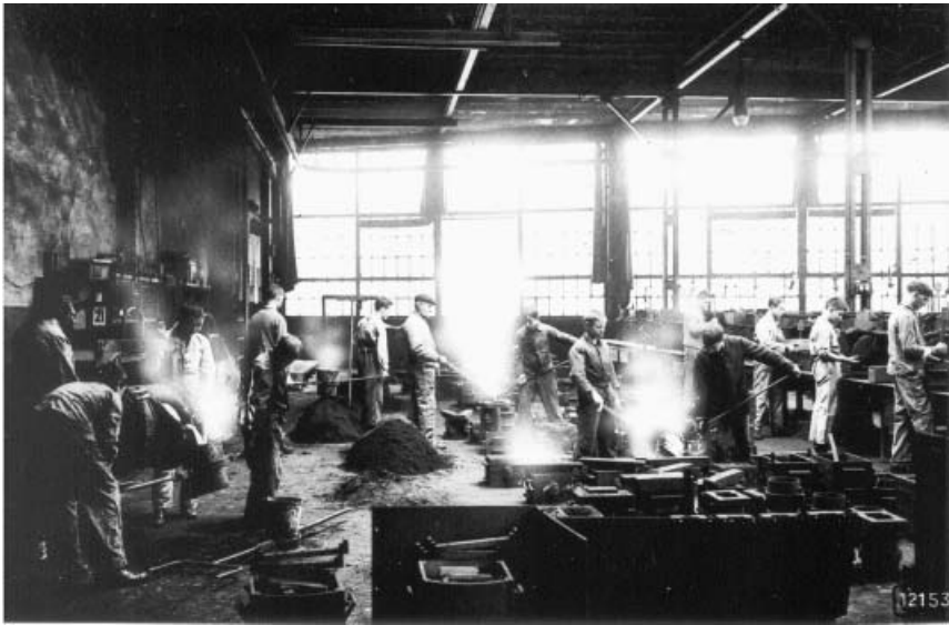
Figure 1. A foundry hall of Sulzer AG around 1900, Winterthur's most important employer at the beginning of the twentieth century.