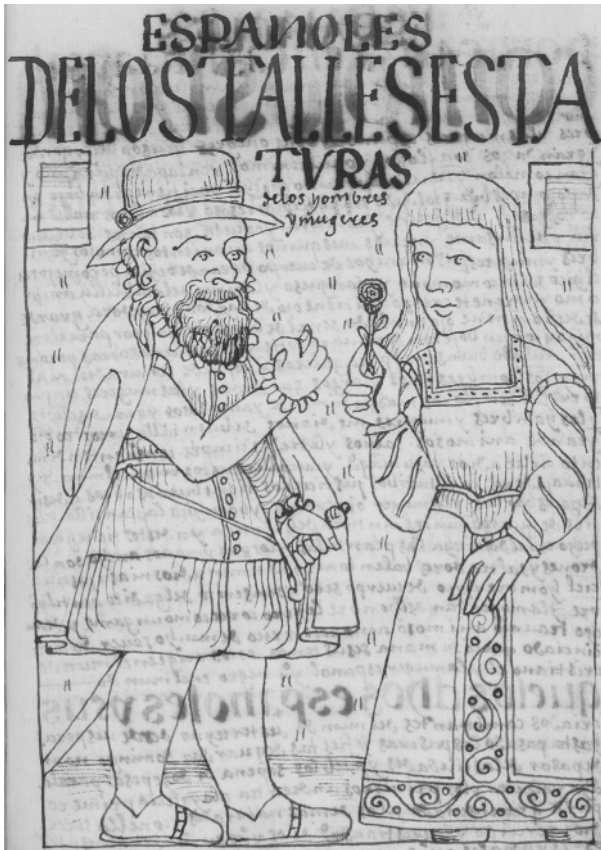
Figure 3 Felipe de Guaman Poma y Ayala, 'The exaggerated size and stature of Spanish men and women, "great gluttons"', 1615–16. Guaman Poma, an indigenous chronicler and artist, depicts a pair of enormous Spaniards. Spaniards regarded themselves as restrained eaters, and were astonished by the fact that indigenous people ate even less than they did. Guaman Poma, in contrast, presents Spaniards simply as gluttons.

we find notable parsimony and temperance. 77 The Indians were thus more abstemious than the most abstemious people in Europe. (See Figure 3.) Settlers often complained, however, that this abstemiousness