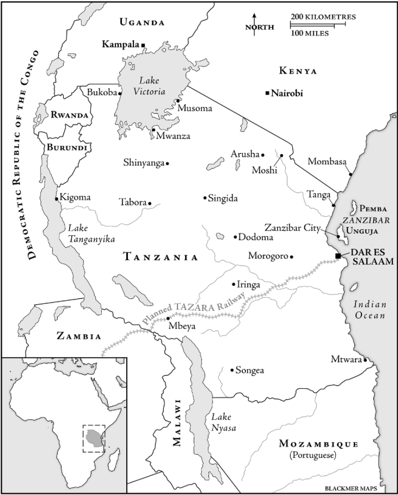
Map 1.1 Tanzania and its neighbours, circa 1968. Map by Kate Blackmer.