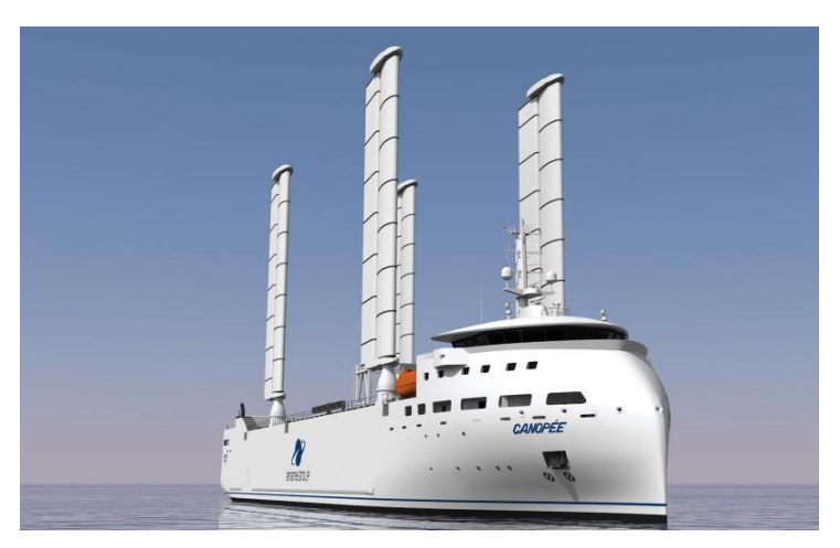
Figure 6: Example of ship equipped with hard sails

Kites (Figure 7): they are attached to the bow of the vessel and use wind energy to substitute power from the main engine. As there is a speed restriction, only tankers and bulk carriers (the slowest ships) can be equipped with this system.