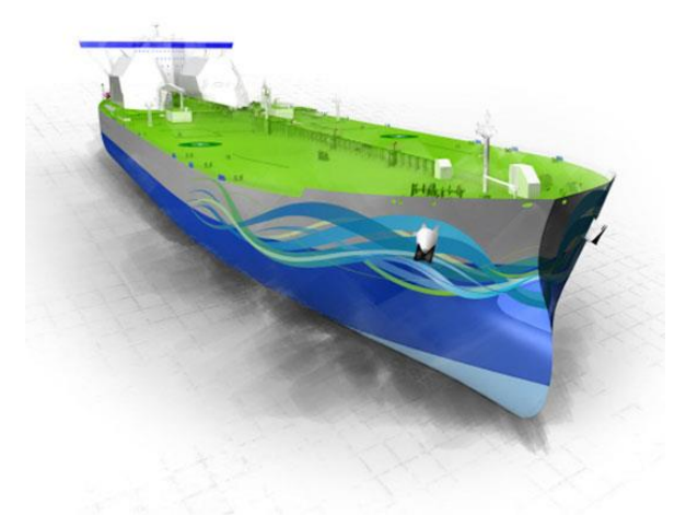
Figure 3: Triality, a DNV's ballast-free VLCC design

Alternative systems fall into two categories (GEF-UNDP-IMO GloBallast Partnerships Programme & GESAMP, 2011): i) no ballast/zero discharge ship designs, and ii) continuous-flow ship designs. For certain ship types, companies such as Det Norske Veritas (DNV) and ClassNK (gCaptain, 2013) developed an innovative crude oil tanker design eliminating entirely the need for ballast water (see Figures 3 and 4).