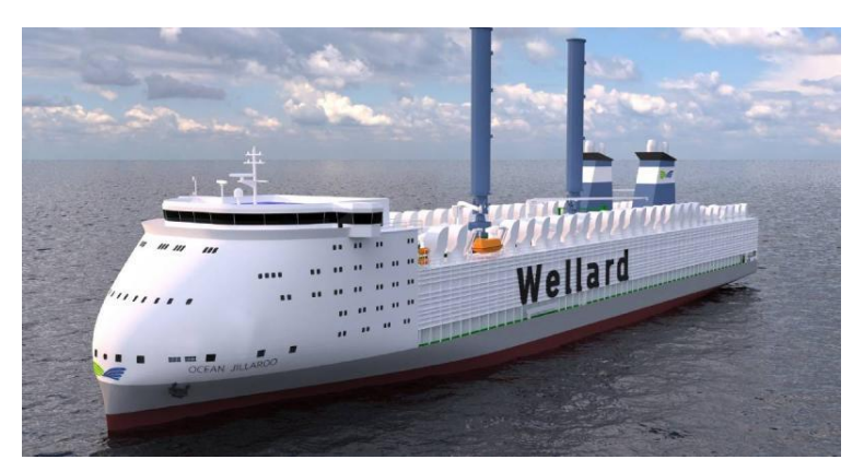
Figure 5: Flettner rotors fitted on a ship's weather deck

- Flettner rotors (Figure 5): they are fixed cylinders on the ship's main deck. They increase both the vessel's air draft, and its resistance to motion in the air (which does not go towards energy efficiency).