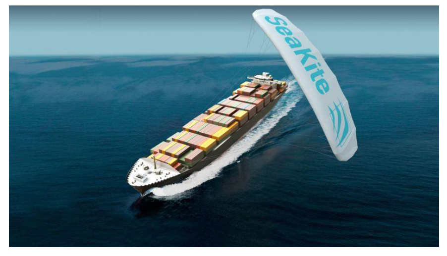
Figure 7: Use of kites to move ships

- Hull innovation (Figure 8): improvements in ship design allow to take advantage of the wind.