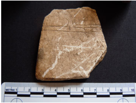
Figure 2. The Wharram Grange Crossroads figurine fragment: dorsal face.

that personhood was ‘not limited to the boundaries of the epidermis’ (p. 126), but could also be constituted through body art, hair styling, clothing, even the use of incense or oils, alongside actual arms, as part of costumes that ‘visually and acoustically accentuated the body’ (p. 127). Qualities of youth, physical power, sexual potency, and courage are illustrated through the ‘blaze’ of light said to surround heroes such as Achilles: a sheen that Treherne discusses in relation to the fleshy-material amalgam of shields, breastplates, blades, hair, muscles, sweat, used in such synergy with the warrior’s body that they became not just trappings but extensions of the self. Treherne draws archaeologists away from the field of violence itself into the most intimate rituals of self-care that protected and strengthened these figures, as well as the rites that dealt with their injuries; prepared and buried their corpses in a fitting send-off, and—their direct corollary—despoiled, stripped, and defamed the bodies of enemies. And finally, he points to the after-work of commemoration: the graveside performances and monuments (warrior ‘stelae’ or tumuli, figurines or motifs) as corollaries of Greek epic poetry, which fixed them in both the land and the memory of their brothers-in-arms and descendants. Seminal to all of