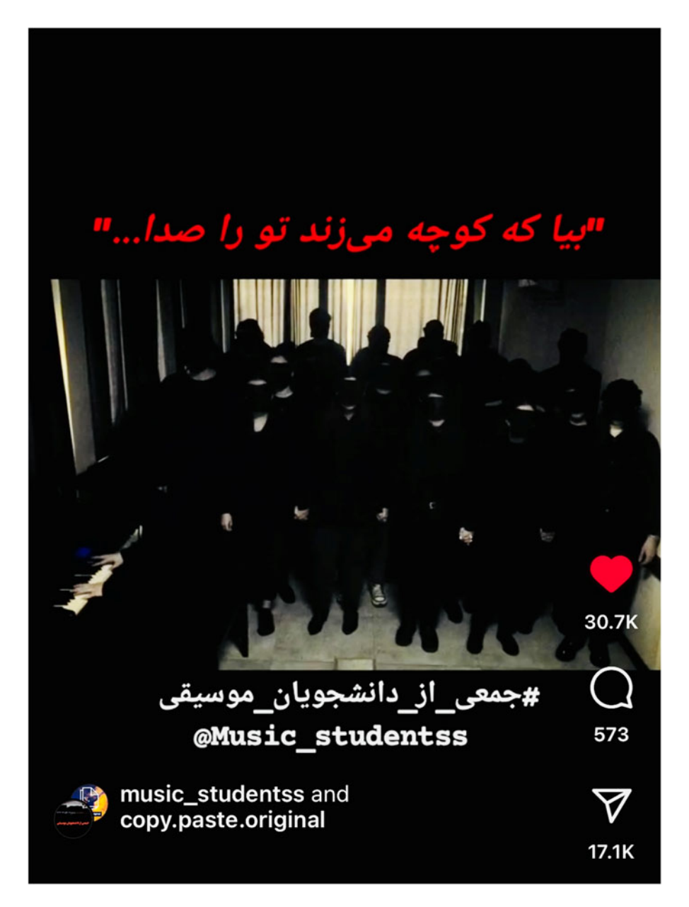
Figure 3. Anonymous students with their faces covered, singing in a darkened room in the "Rah-e Kucheh" music clip. Source: Instagram video, music_studentss, accessed 6 November 2023, https://www.instagram.com/reel/Cl0qh-CrfPy/?utm_source=ig_web_copy_link&igshid=MzRIODBiNWFIZA==.

The reverberation of laughter is loud and united The chant Woman, Life, Freedom is the message of our generation.<sup>8</sup>