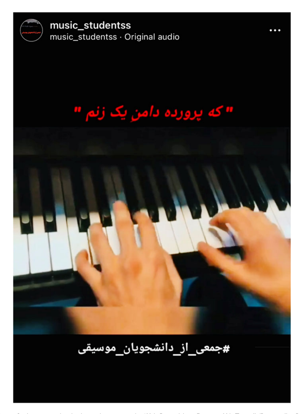
Figure 2. Anonymous hands playing the piano in the "Keh Parvardeh-ye Daman-e Yek Zanam" (Because I've Been Raised By a Woman) video.

For the tresses of the girls of revolution For my people, following tradition Don't be afraid and agitate for the rights of women Let's shatter the banner of the enemy's oppression Because a bright future is expecting us The past is almost a story on children's lips