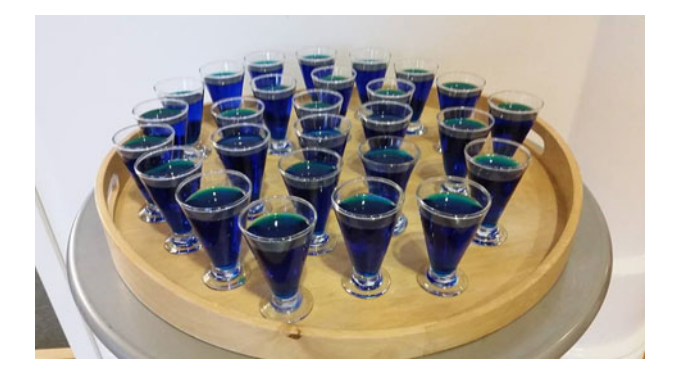
Fig. 1. The blue shot experiment: 'You take the blue pill – the story ends, you wake up in your bed and believe whatever you want to believe. You take the red pill – you stay in Wonderland, and I show you how deep the rabbit hole goes' (Morpheus in The Matrix).

Our approach was to use sensory immersion as a way to create a strong connection between the ocean, global change science and individuals. We combined guided discussions with field trips. Discussions encourage critical thinking, scepticism and allow students to take ownership of ideas and arguments and are also a way to develop a personal connection with a topic (Zeidler, 1997). Field trips promote contact with the ocean and are postulated to have a positive impact on specific aspects of learning (e.g. Ramasundaram et al. , 2005). For example, Stepath (2006) showed that a field trip