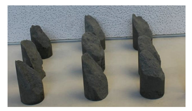
Figure 2. Broken backfill samples after performing uniaxial compressive strength test