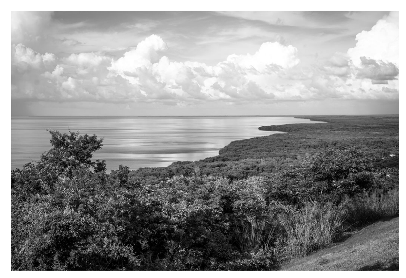
FIGURE 1.5 Rainforest meets the Gulf of Mexico along the western coast of the Yucatan peninsula, Bay of Campeche.