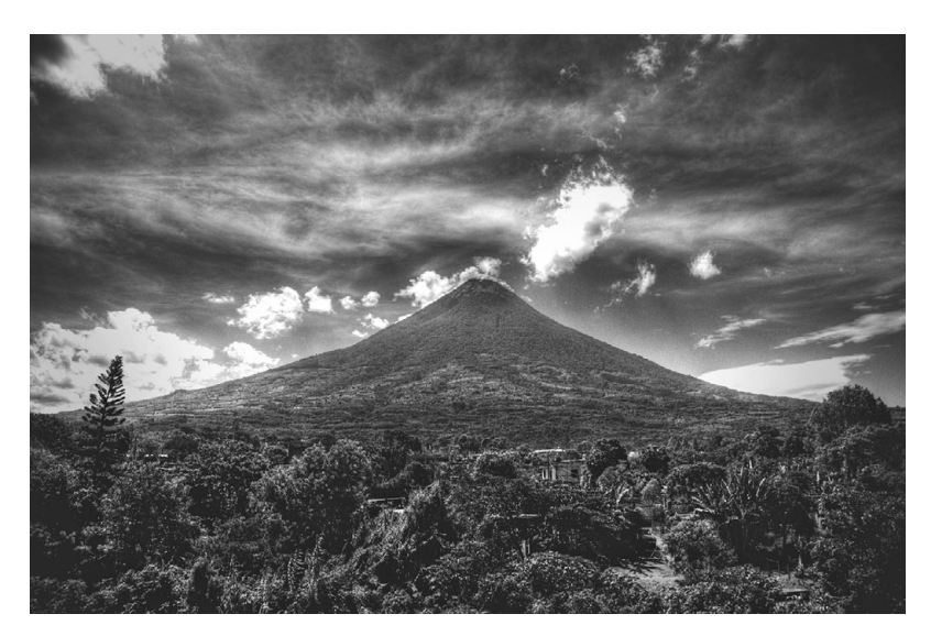
FIGURE 1.4 Agua Volcano, near Antigua, Guatemala, in the Maya highlands. Volcanic activity created the abundant obsidian resources used by ancient Maya people, but remains a risk to modern occupants of the Maya highlands.

Guatemala, and lowlands that run from where the highlands end up through the tip of the Yucatan peninsula. Resources and terrain vary in predictable ways between the highlands and the lowlands, with granite, obsidian, and jade found in the mountainous region, while tropical animals and plants are found in the lowlands (Figure 1.4). Add to this the longest coastline of any ancient society, with approximately 1,500 kilometers of inlets, bays, and shallow beaches. Coastal resources such as shell and dried fish made their way deep inland throughout almost the entire Maya area (Figure 1.5). In the middle of the peninsula, the lowlands are cut through with rivers that often run over dangerous rapids or through narrow gorges that made the ancient cities perched on nearby escarpments easy to defend (Figure 1.6). Toward the northern part of the peninsula the rivers disappear but are replaced by natural sinkholes that provide access to underground freshwater reservoirs (Figure 1.7). The seasons in the entire Maya area, as in most tropical regions, are governed by the presence or absence of daily rains. In the summer it often rains every