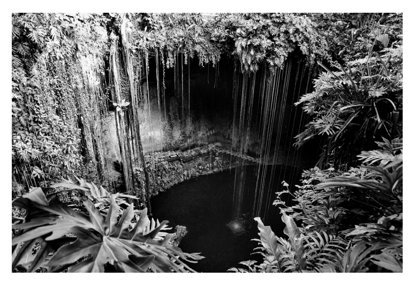
FIGURE 1.7 Cenote Ik Kil, near Valladolid, Mexico.

day and powerful storms or hurricanes blow through the region. In the winter it is drier and it rains less frequently.