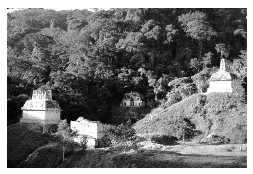
FIGURE 1.9 The Cross Group at Palenque, Mexico. The Temple of the Cross, the Temple of the Sun, and the Temple of the Foliated Cross all record cosmological information about the origin of the world. Photograph by the author.

marked with the sign for sun.<sup>5</sup> A nearby shrine known as the Temple of the Sun has imagery and text concerning sacred warfare, which we know was much more than warfare in terms of battles and weaponry (which were also important to Maya rulers, as we will see in Chapter 4). Warfare in this type of cosmological context was a metaphor for the cyclical processes of experimentation, failure, and eventual success described in the paragraph above. In the imagery of this shrine the Jaguar War God, who travels between the stars and the watery underworld, does battle in order to perpetuate creation. The final textual passage, found at the Temple of the Foliated Cross, is dedicated to the power of agriculture and the importance of water. Maize is shown growing from a mask that represents the cosmic sea and the text describes the birth of K'awiil, the god of lightning and dynastic power. From this one site, which admittedly has a very rich record concerning the origin of the world, we learn about the