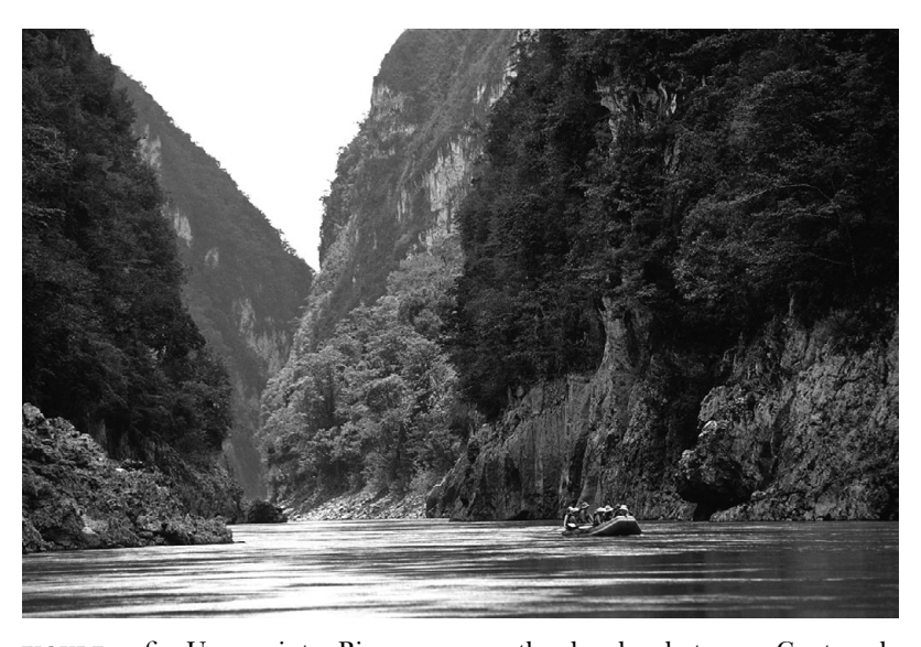
FIGURE 1.6 Usumacinta River canyon, the border between Guatemala and Mexico.