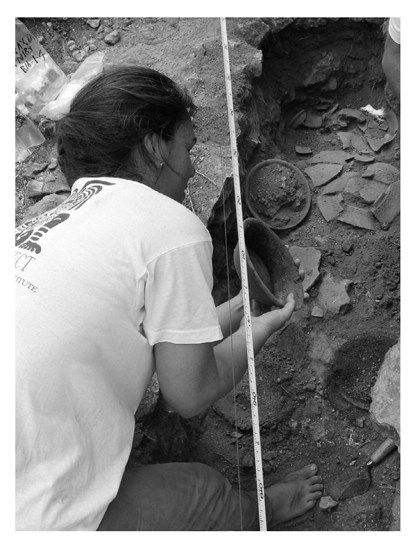
FIGURE 1.2 The author excavating ceramic vessels from a burial context at Xuenkal, Mexico.

as animists, taking spiritual lessons from nature. My archaeological research in the Maya area continued while I had two sons, and they accompanied me to the field. I improvised how to balance field research and parenting, and we experienced the extraordinary kindness of many Maya people and Mayanist scholars who rescued me from my improvisations. I have written about how taking my kids into the field transformed my understanding of modern Maya life, as once I had kids, Maya women felt we had a lot more in common and started talking to me about their lives. I am fortunate to teach at a university and my choices about what to include in this volume are shaped by the decades of students I have taught about the Maya and their questions about this amazing culture. I am also deeply committed to sharing the knowledge my field produces with the interested public, and through museum exhibits, public lectures, and articles I have developed a