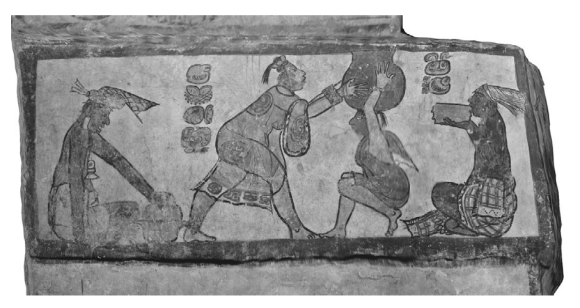
FIGURE 1.1 Wealthy merchant known as the "Woman in Blue," from a Classic period mural on the Chiik Nahb structure sub 1-4, Calakmul, Mexico.

merchants, skilled tradespeople, architects, and healers – those who were neither royalty nor commoners (Figure 1.1). Scholars are slow to adjust their models of ancient societies, but today we acknowledge the importance of moving beyond a binary of inequality that includes only the nobles and the poor. One useful suggestion is that we relinquish "elite" and "commoner" in favor of more specific terms such as the occupational categories listed above, which better capture systematic measures of wealth, status, and power.<sup>1</sup>