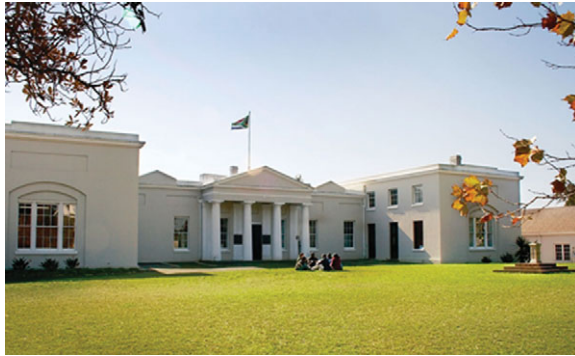
Figure 4. The South African Astronomical Observatory, the institute that has been selected to host the IAU Office of Astronomy for Development (OAD). This office will coordinate IAU capacity building activities globally and will begin operations in March 2011.