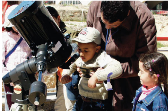
Figure 3. Universe Awareness (UNAWA) is a programme to expose underprivileged young children aged from 4 to 10 years to the inspirational aspects of astronomy. By raising awareness about the scale and beauty of the Universe, UNAWA attempts to stimulate tolerance, broaden the mind and awaken curiosity in science, at a formative age when the value system of children is developing. The photos show UNAWA activities in Tunisia.