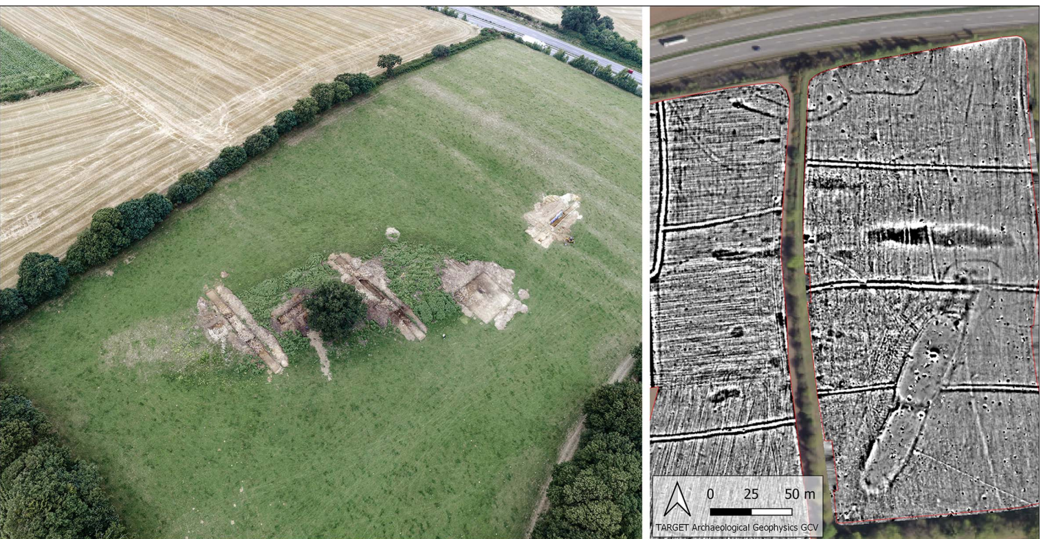
Figure 2. Left) drone view of the mound: the intact burial chambers are visible in the test pits to the left, and the quarry to the right of the photograph; right) magnetic cartography around the mound (survey by John Nicholls/TARGET).