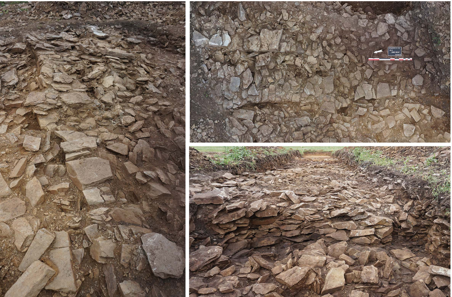
Figure 3. Façades of the cairn: north-west (left and upper right), and south-east (lower-right).