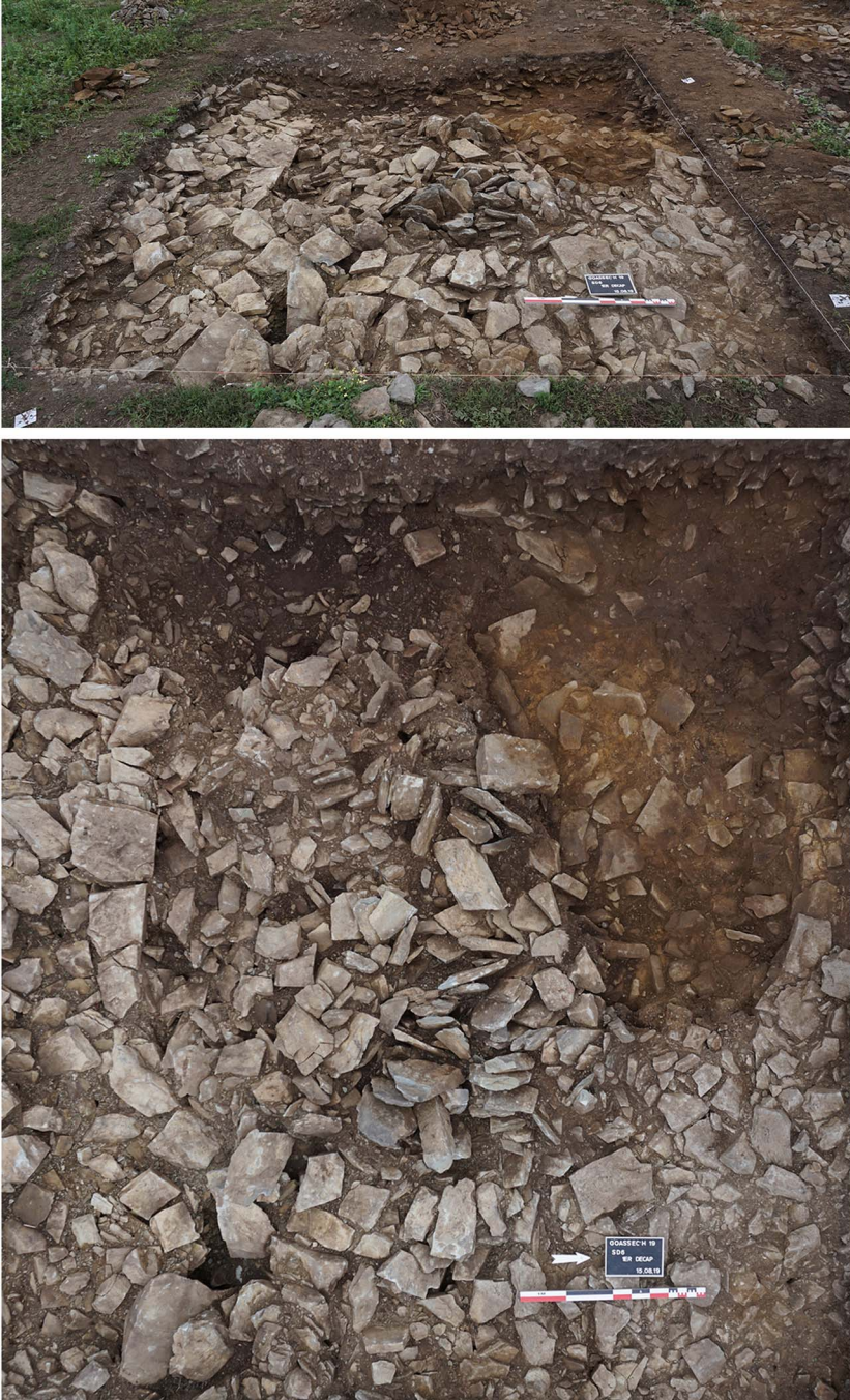
Figure 4. Passage grave with an axial passage and corbelled vault collapsed onto the yellow fill of its circular chamber.