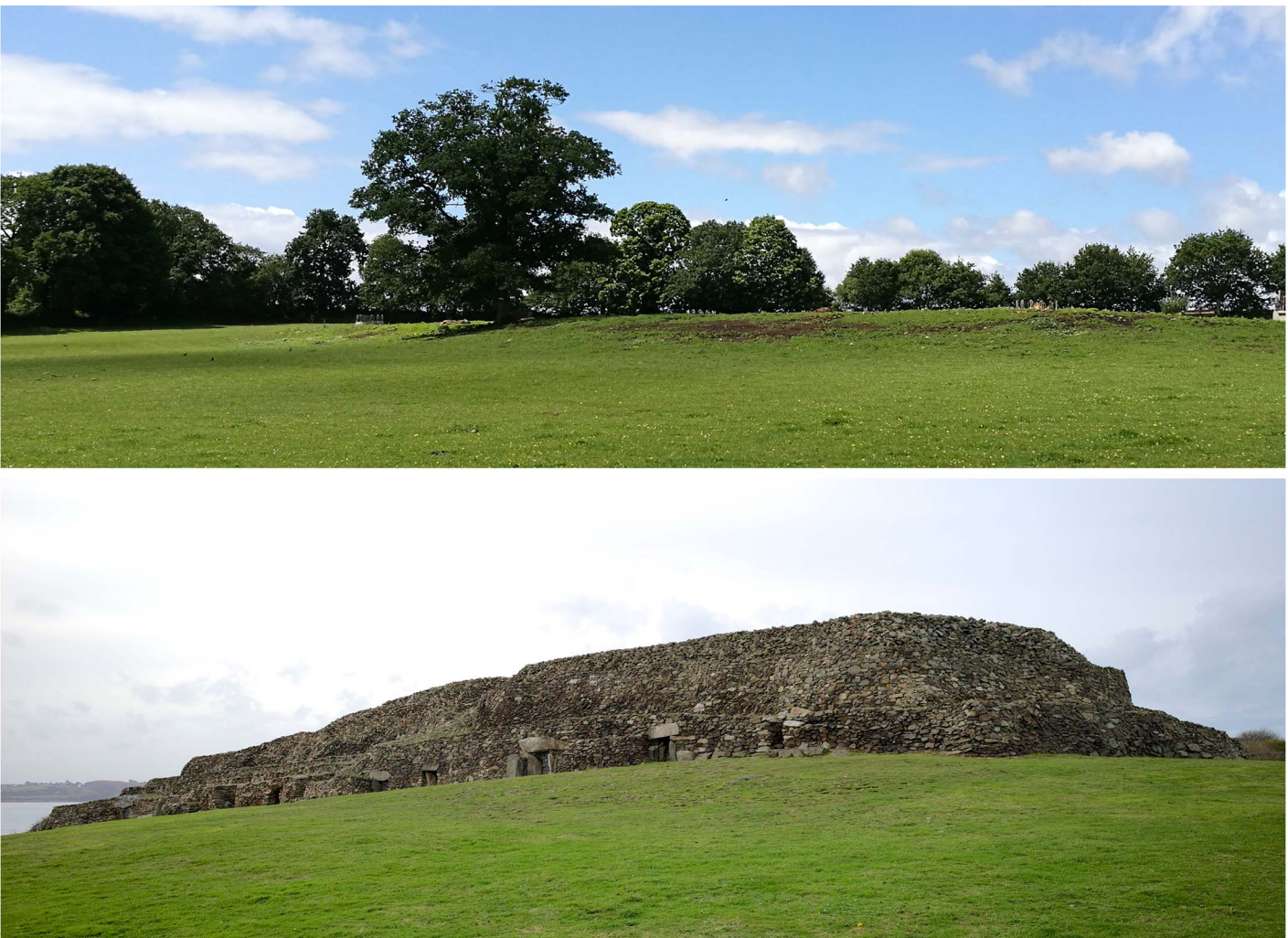
Figure 5. Comparison between the sites of Goassec'h (above) and Barnenez (below).