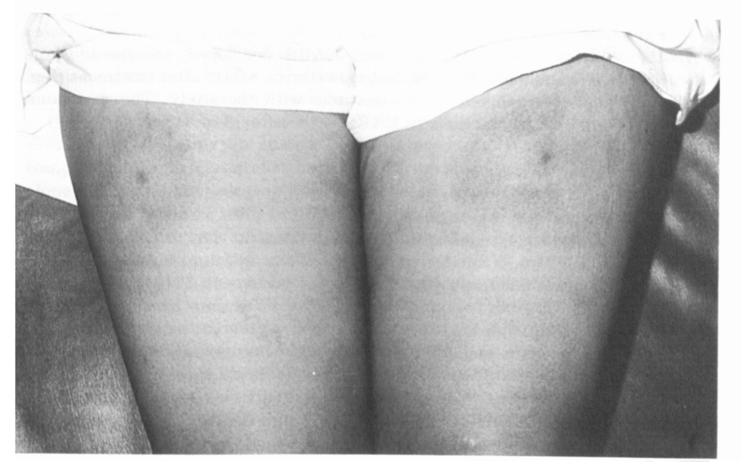
Fig. 1. Thigh intradermal injection sites in a patient with a generalized urticarial erythematous reaction 8 days after receiving PCEC and equine antirables serum.