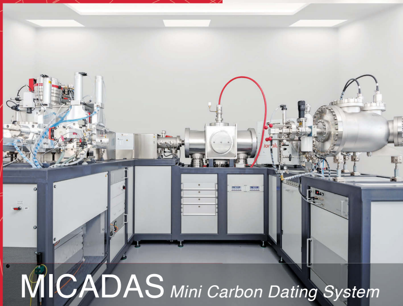
MICADAS Mini Carbon Dating System

Scientific Instruments for Radiocarbon Dating and Accelerator Mass Spectrometry