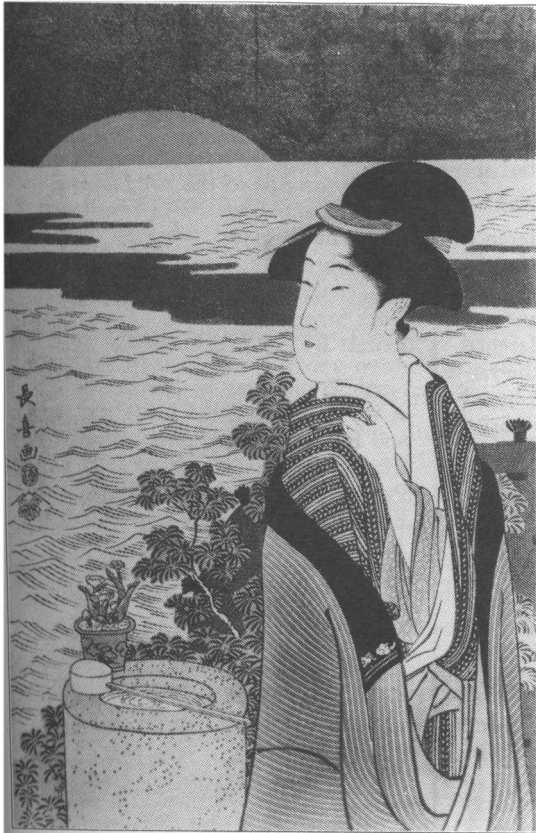
Eishosai Choki, Sunrise on New Year's Day 1790s Colour Woodcut, signed British Museum