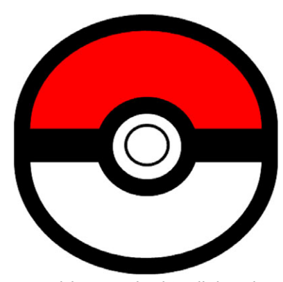
Figure 2: Drawing of the original Poké Ball, from the Pokémon series. The red portion represents the fat, which is less dense and stays in the upper portion of the cyst. The white portion represents the fluid, which is in denser, and stays in the dependent portion of the cyst. The central round portion represents the floating nodule in the fat-fluid interface, composed of multiple spherules of fibrin, keratin, fat, sebum, and hair.

Originally, Poké Ball is a round compartment, used to store pokémons, from the Japanese cartoon series Pokémon (Figure 2). The "Poké Ball sign" is a radiological finding widely described in mature ovarian cystic teratomas, characterized by a cyst with a fat-fluid level, associated with a globular structure floating in its central portion. Histopathologically, the cyst is represented by oily fluid in its dependent portion and fat in its superior portion. The central floating round component usually is composed of multiple spherules of fibrin, keratin, fat, sebum, and hair. To the best of our knowledge, this sign has not yet been described in intracranial mature teratomas/dermoid cysts, although it is well described in the ovaries. Although some authors reported a sensitivity of 25% for this sign, it can be considered pathognomonic of teratoma. Use of the diagnosis of intracranial dermoid cyst/teratoma.