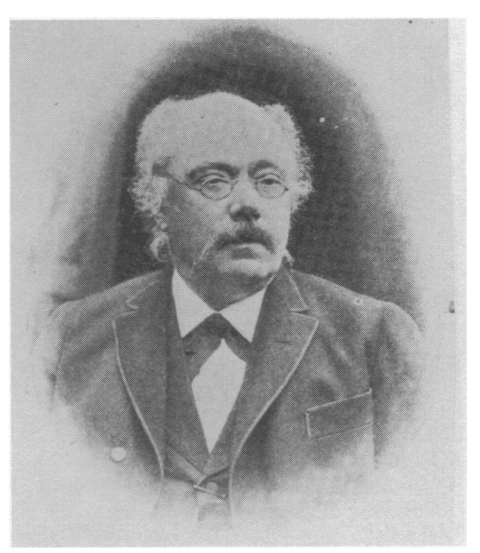
Figure 6: Johann Hermann Baas (1838–1909).