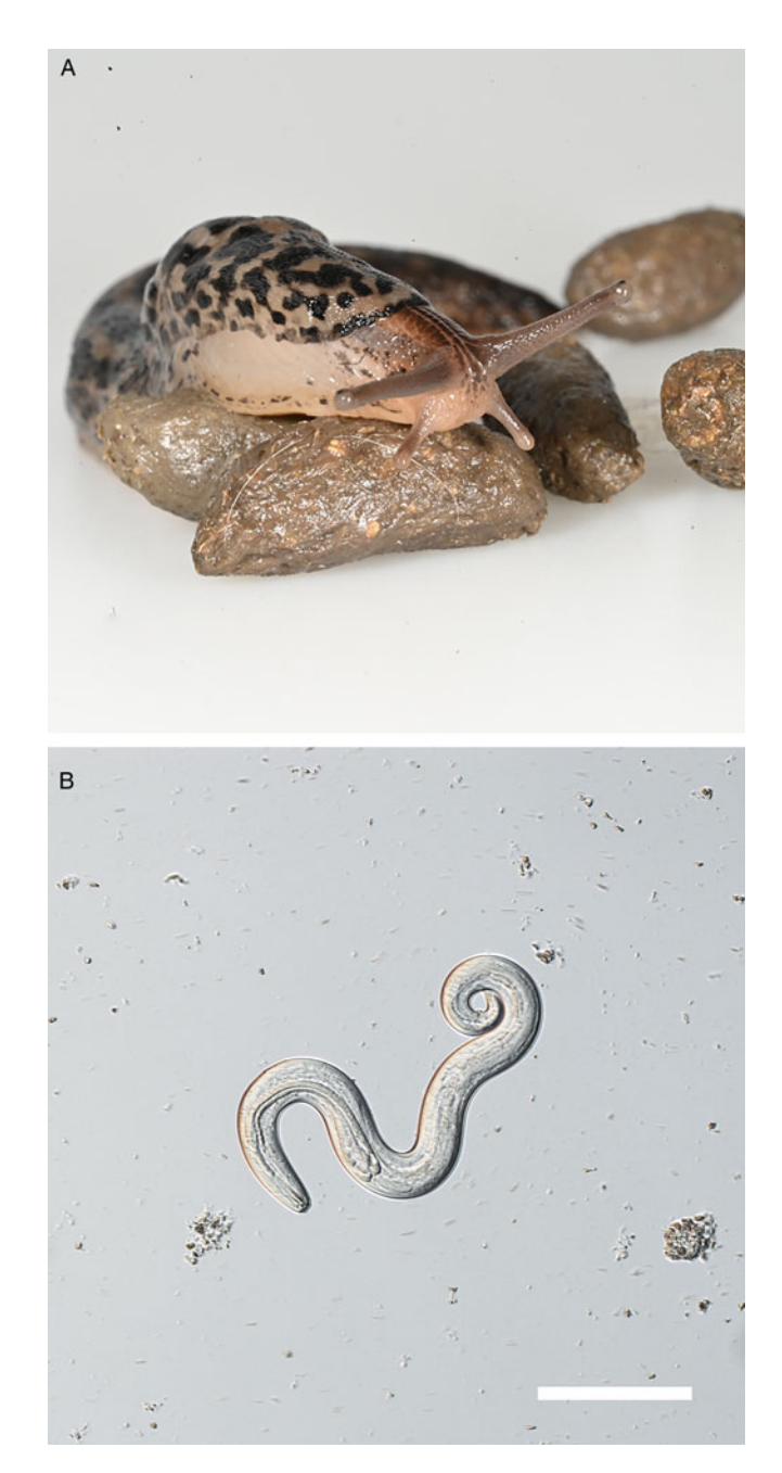
Figure 1. Hosts and developmental stages of A. cantonensis in described experiments. A. Slugs Limax maximus feeding on fresh rat feces; B. Angiostrongylus cantonensis L3 larva collected from artificially digested slugs, scale bar = 100 \,\mu m.

Slugs from group K1 (22) were used for confirmation of infection success. These slugs were sacrificed 4 weeks after the infection period, artificially digested as described and the number of