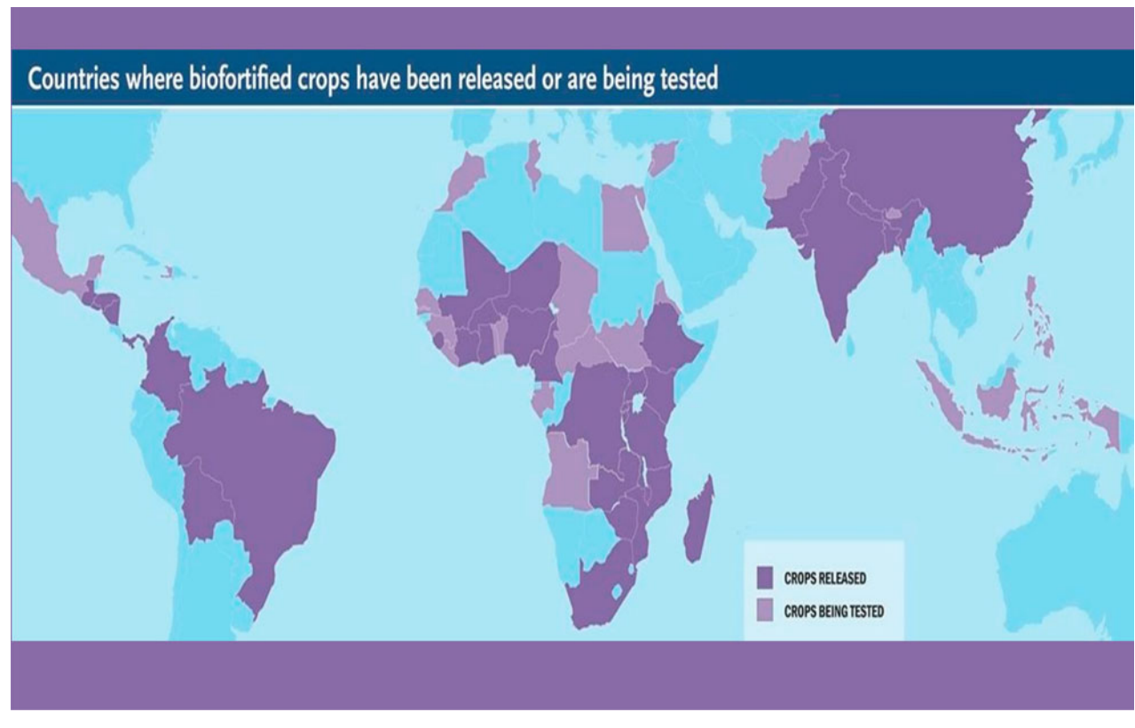
Fig. 2. (Colour online) Distribution of biofortified crops.