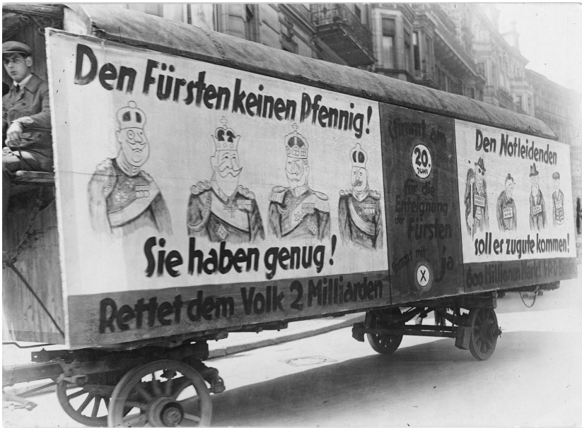
Figure 15 'Not a penny for the princes!' Election poster from Germany, 1926. 'Den Fürsten keinen Pfennig! Sie haben genug! -rettet dem Volk 2 Milliarden Den Notleidenden soll es zugute kommen!' [Not a penny for the Princes! They have enough! – save 2 billion for the people/It should benefit those in need!] Election propaganda car (1926); Aktuelle-Bilder-Centrale, Georg Pahl. Source: Bundesarchiv, Image 102–00685

In the early twentieth century, German aristocrats had become objects of satire in Germany and in the Habsburg lands. The Munich-based satirical magazine Simplicissimus ridiculed the Ostelbian Barons as symbols of the old world. 'Let them cremate you, papa, then you won't have to turn so much later on,' reads the caption on one caricature dating from 1906 [Fig. 14].