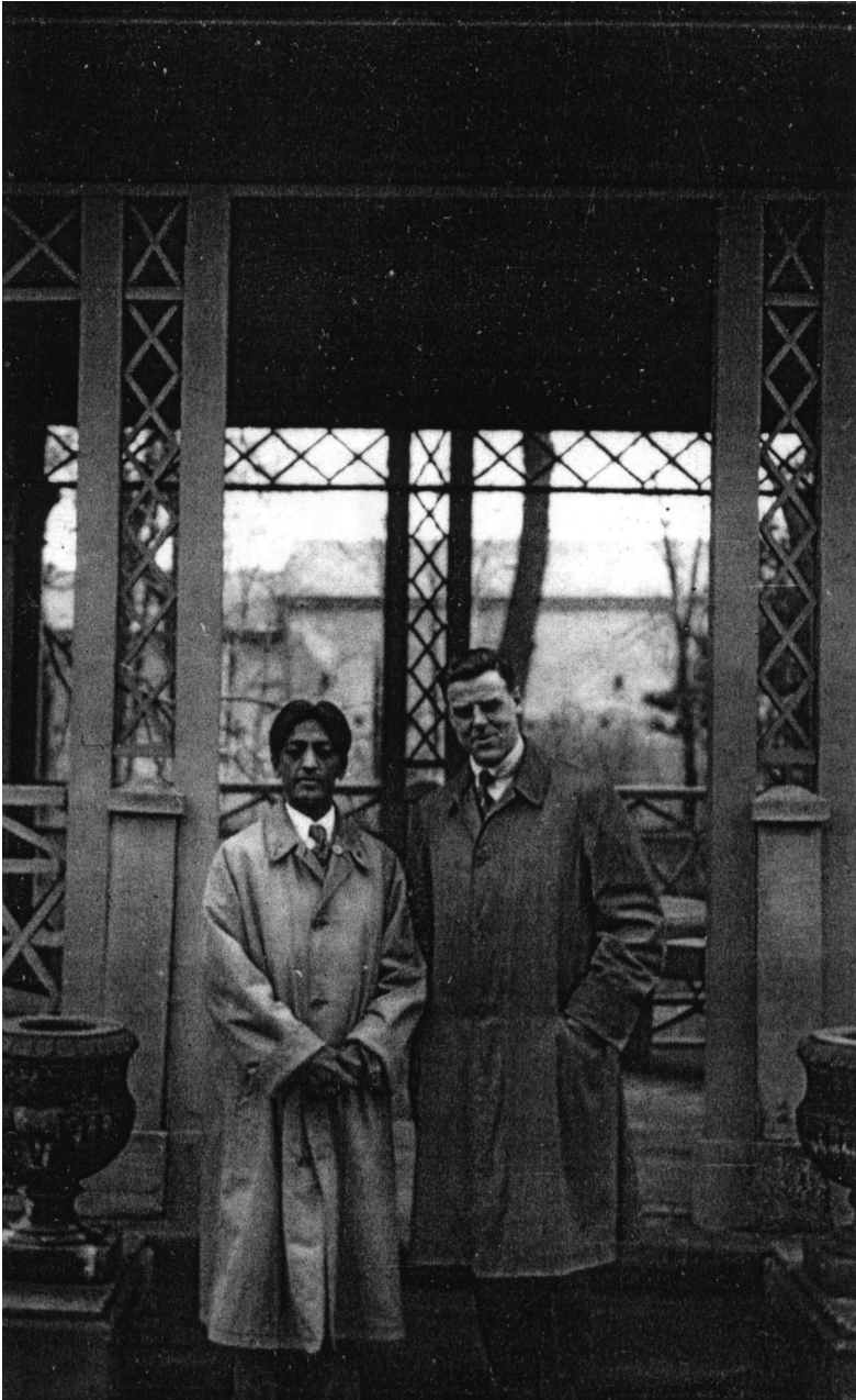
Figure 17 Hans-Hasso von Veltheim and Jiddu Krishnamurti at the sun terrace in Ostrau (April 1931)