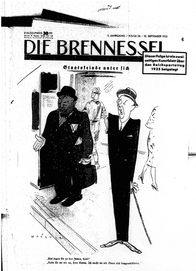
Figure 20 'Enemies of the state in each other's company', in: Die Brennessel , 5:36 (10 September 1935). BA R 43 II 1554–5, 61ff.