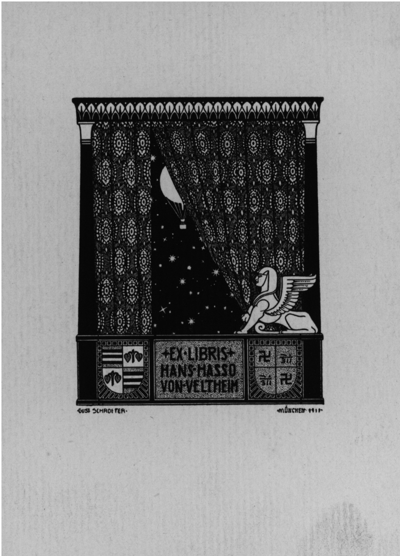
Figure 16 Veltheim's exlibris, designed by Gustav Schroeter (1918), in Hans-Hasso von Veltheim Archive, Ostrau. Depositum Veltheim at the Universitäts- und Landesbibliothek Sachsen-Anhalt, Halle (Saale)