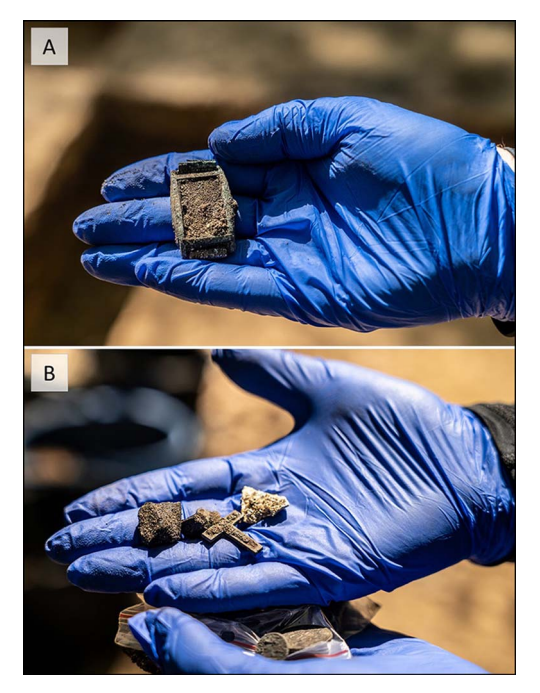
Figure 6. Material evidence of the crime in the Szpęgawski Forest: A) a wristwatch; B) burned human remains and a cross.

Between the end of October and the end of December 1944 in the Szpęgawski Forest, the Nazis were trying to erase all evidence of the crime. The exhumation commando extracted the corpses of victims and cremated their remains. In October 1945 and May 1947, Polish authorities carried out further exhumations in the Szpegawski Forest.