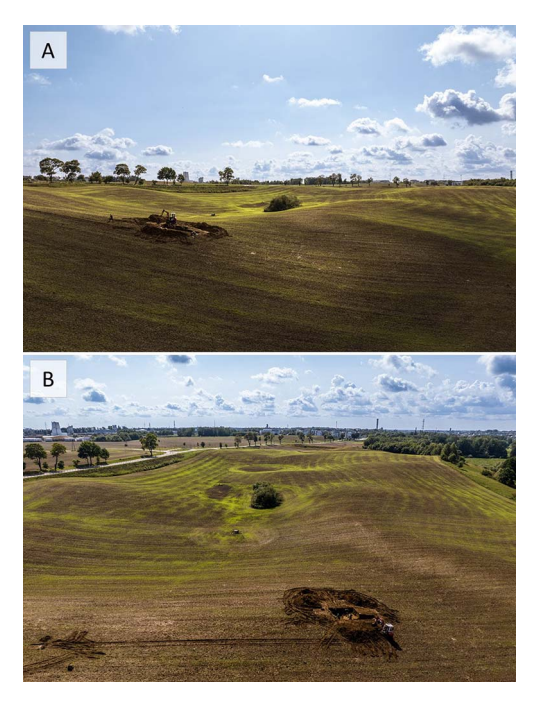
Figure 2. Death Valley: A) opening the trench; B) location of the trench in the local landscape.