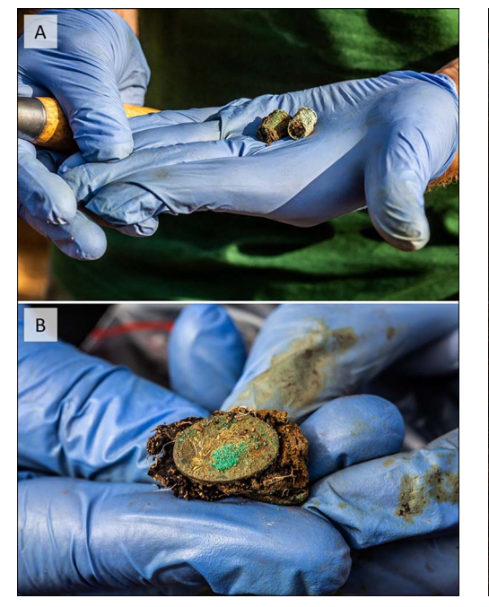
Figure 4. Material evidence of the crime in Death Valley. A) pistol casings; B) a gold-plated cufflink.

The second mass-execution site examined in 2023 was in the Szpegawski Forest, where a reported 2413–7000 human beings were taken and murdered by the Germans between September 1939 and January 1940. That mass execution also targeted members of the local intelligentsia, the mentally ill, general labourers and farmers, among others (Kobiałka et al. 2024).