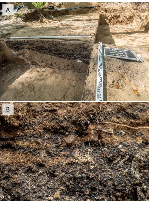
Figure 5. Mass grave in the Szpegawski Forest: A) excavating the grave; B) close-up of the layer consisting of burned human remains, artefacts and charcoal.

© The Author(s), 2024. Published by Cambridge University Press on behalf of Antiquity Publications Ltd