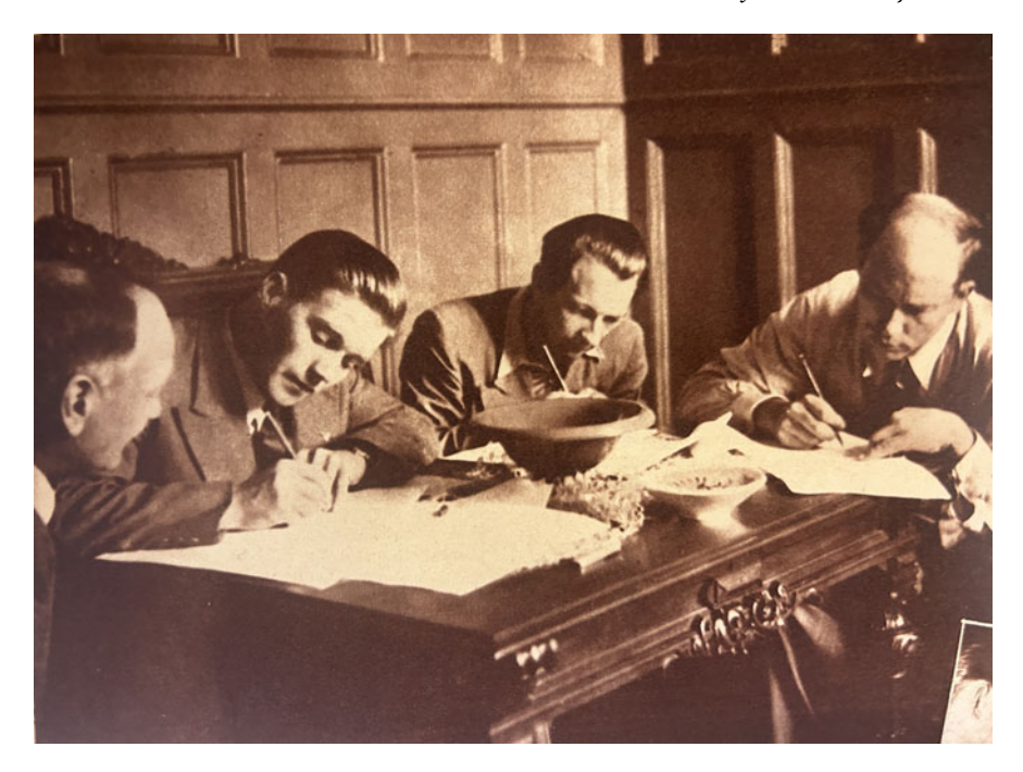
Figure 2 Participants in the MWU's Time-Motion Studies Course. Metallarbetaren, 5/7 (1944) (nr. 27, year 55), p. 8.

replaced by one concerning rationalization and the balance of power. For instance, workers noted that management was conducting time-motion studies on newly hired workers who had not received training from the union. During the 1935 conference, one worker claimed that they lacked the time to organize their new colleagues owing to their vast number and inexperience. There was a concern that it could have a detrimental effect on piece rates. Another worker reported to the 1938 conference that: