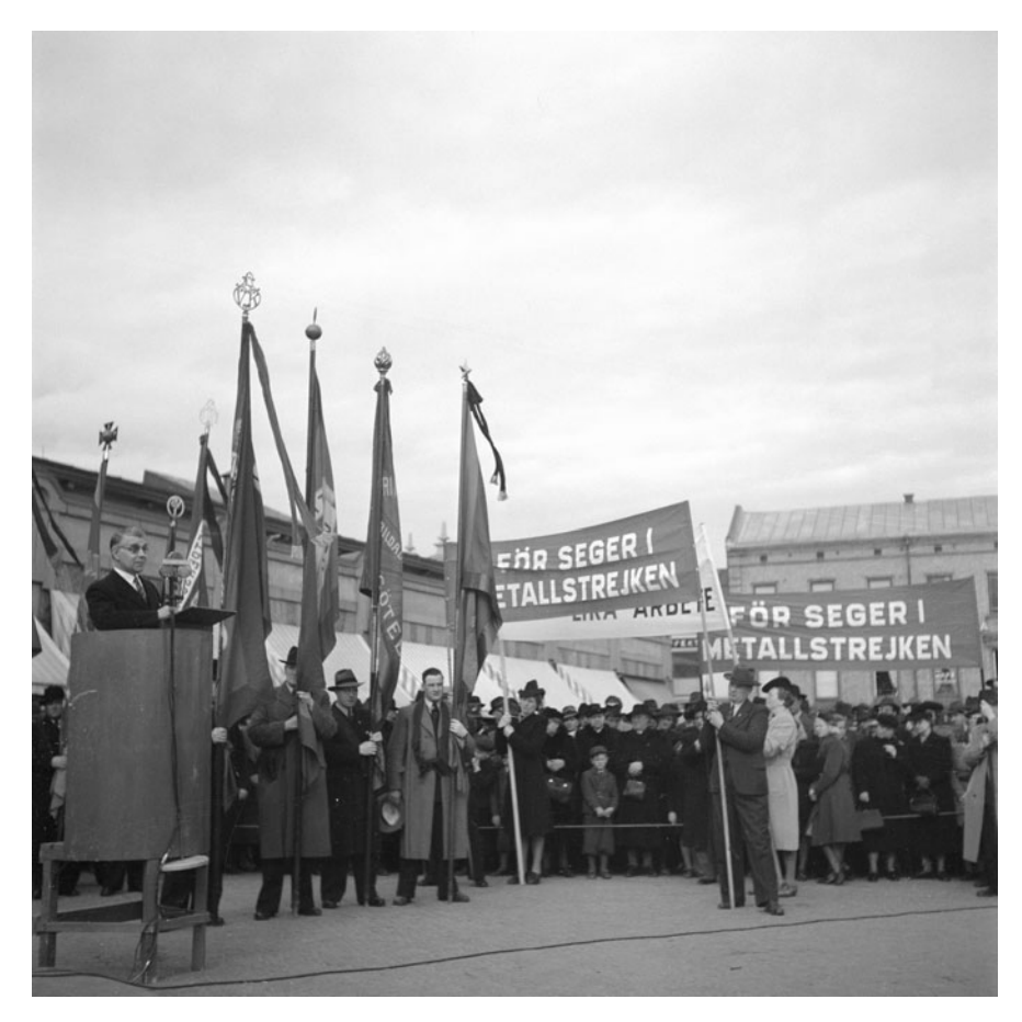
Figure 3 Striking metal workers demonstrating in Gothenburg, 8 April 1945. The banners say, "For Victory in the Metal Strike".