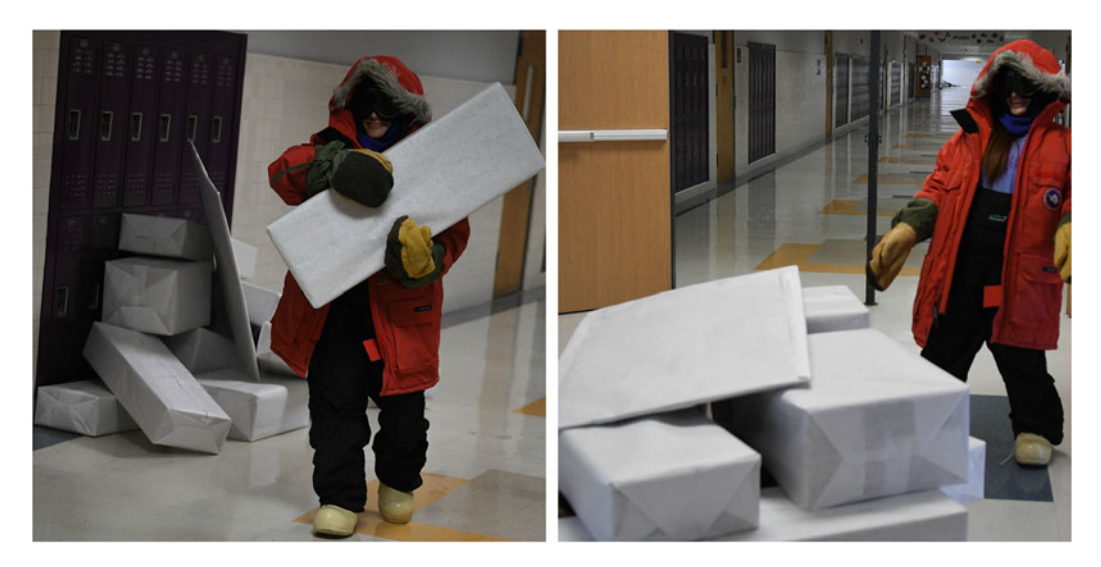
Fig. 1. Student participating in a class project entitled, Polar-ympics, transporting "ice blocks" for construction of an igloo.

From program evaluation data, there has been a statistically significant improvement in the teacher's self-assessed ability and confidence to increase the variety of scientific processes in their lessons (ARCUS, 2010, 2012, 2015). As a growing emphasis is placed on Next Generation Science Standards (NGSS) in the USA, teacher content knowledge is essential to student achievement in science, but the practice of science is even more essential (Darling-Hammond, Wise, & Klein, 1995; Wrenn & Wrenn, 2009). K-12 teacher quality is a major factor influencing students' decisions about pursuing STEM degrees and occupations (Ashby, 2005).