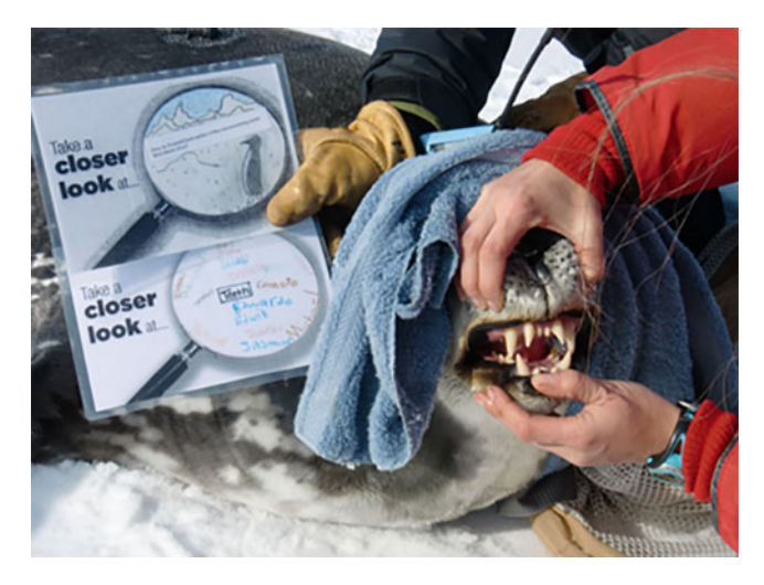
Fig. 6. Informal science educator, Alex Eilers, holding "student magnifiers" near a Weddell seal. Magnifiers were brought on the expedition as a part of the team's outreach programming.

A significant piece of the team's education and outreach included regular online journals to connect the expedition with its audience in the Memphis region, and connect the science being studied in the field with the curriculum taught in the classroom. For instance, the Take a Closer Look project began with classroom presentations in which students participated by selecting a polarrelated science topic of interest. The students wrote or drew the topic inside a Take a Closer Look magnifier (Fig. 6), and the magnifiers were later photographed in the field and used to lead each online journal entry. The project's impact was extensive with several hundred student and class entries received, along with dozens of thank-you notes expressing appreciation for the project. One teacher commented, "The students were thrilled to have you {visit} because we had talked about your upcoming trip to Antarctica. Your excitement about going is contagious and the students are now researching other topics on the 'Closer Look' page". A student