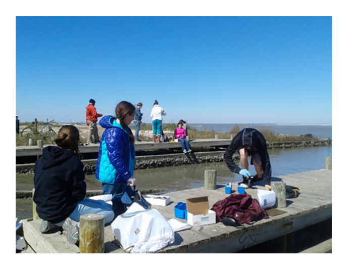
Fig. 4. SMORE students in Texas conduct onsite water tests at Smith Point estuary.

to a group of teachers and students at the 2008 Society for Advancement of Chicanos Hispanics and Native Americans in Science (SACNAS) Conference, and in 2011 to classroom students in Utqiagvik (formerly Barrow), Alaska.