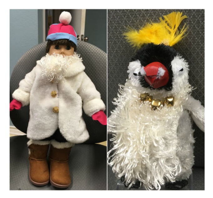
Fig. 2. Anastasia and Kiwi are characters in the form of stuffed dolls designed and created by fashion design students at Richardson High School to help engage elementary-aged youth during the expedition.

In the final event, Ice Rescue – STAT , researchers in the field come across an injured party who needs to be transported to base camp. They were provided a makeshift sled (flattened cardboard box), placed the injured party on the sled, and then returned to base camp, without the injured party falling off the sled.