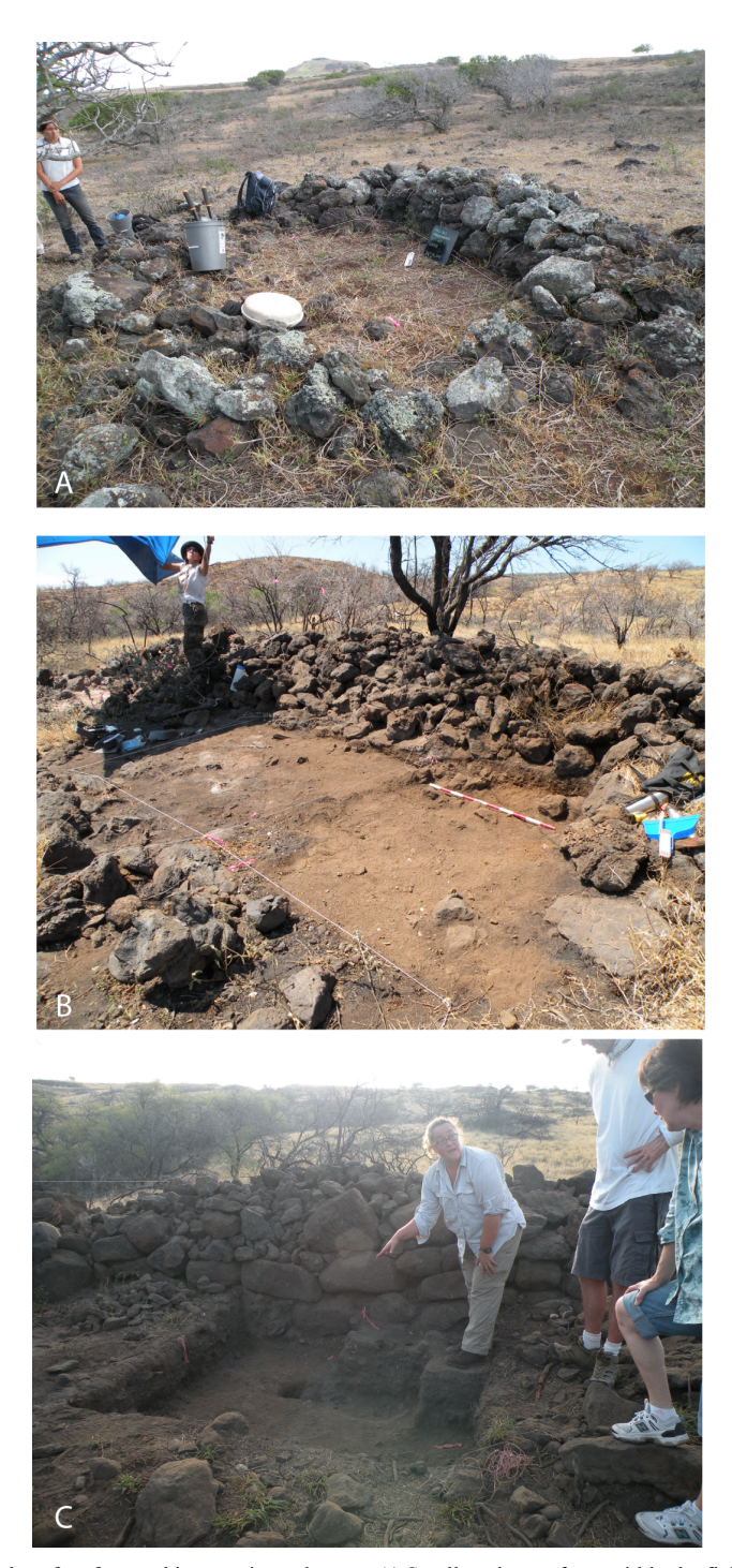
Figure 2 Examples of surface architecture in study area: A) Small enclosure from within the field system (MKI-303), basal cultural deposit dates to Period I; B) Large terrace with windbreak wall, from coast (KAL-30A); hearth features date to Period II; C) Large enclosure with massive walls and basal stones (MKI-56); coral from beneath wall dates structure to Period III.