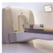
Leksell Gamma Knife® Perfexion™