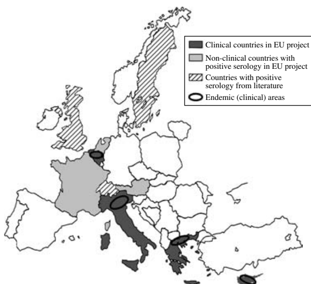
Fig. 1. Geographical distribution of clinical EMCV outbreaks and the serological status of countries participating in the European research projects.

outbreaks with mortality in both groups. In four outbreaks, the fattening pigs were affected while in one outbreak mortality was found in both weaned piglets and fattening pigs. The duration of the more severe outbreaks was from one to several months. The frequency of EMCV outbreaks appeared to be highest during the autumn–winter period (Fig. 3).