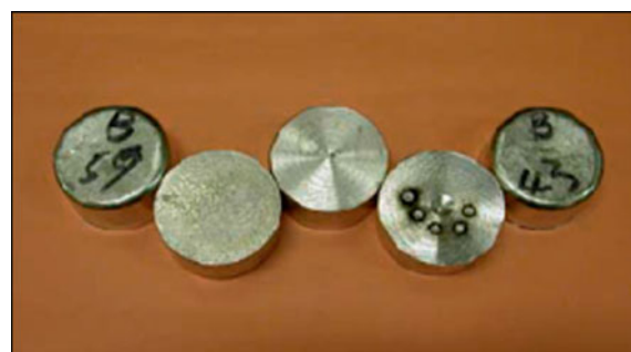
Figure 3. Disks of Standard Reference Material (SRM) 1728 Tin Alloy (Sn–3Cu–0.5Ag), a lead-free solder composition, showing various stages in manufacturing and testing. The alloy was created using a semi-chill casting process to ensure homogeneity of the disks to a depth of at least 10 mm. The SRM provides values for bulk composition of a number of elements, including chromium, cadmium, mercury, and lead, which are restricted in products around the world for environmental and health reasons. 33

Driven by COST (European Cooperation in Science and Technology) Action 531 35 on lead-free solder materials, databases of solder thermodynamic and physical properties have been compiled. For example, the National Physical Laboratory (NPL), the UK’s NMI, has established a public database of critically evaluated thermodynamic parameters for over 50 binary alloys and numerous ternary systems of eleven elements that can potentially be used in lead-free solder formulations. 36 The Polish Academy of Sciences compiled the downloadable SURDAT database, 37 which lists experimentally determined molar volumes, densities, and surface tensions of Ag–Cu and Sn–Ag–Cu systems. In addition, the Japanese Standards Association has established test methods for determining critical physical and engineering properties of lead-free solders (JIS Z 3198-1–JIS Z 3198-7).