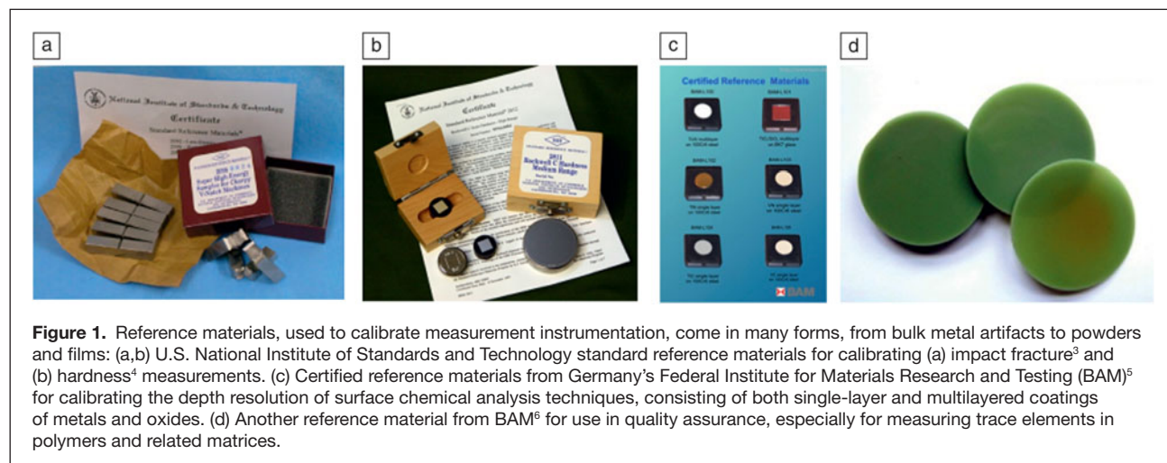
Figure 1. Reference materials, used to calibrate measurement instrumentation, come in many forms, from bulk metal artifacts to powders and films: (a,b) U.S. National Institute of Standards and Technology standard reference materials for calibrating (a) impact fracture 3 and (b) hardness 4 measurements. (c) Certified reference materials from Germany's Federal Institute for Materials Research and Testing (BAM) 5 for calibrating the depth resolution of surface chemical analysis techniques, consisting of both single-layer and multilayered coatings of metals and oxides. (d) Another reference material from BAM 6 for use in quality assurance, especially for measuring trace elements in polymers and related matrices.

To validate environmental claims about their products, polymer manufacturers need reliable measures of the bio-based content in their feedstocks, which can also contain petroleum-based sources. The accepted measure of bio-based content is the level of 14 C isotope in the feedstock (basically, carbon dating), because ancient petroleum has lost its 14 C through radioactive decay whereas feedstocks derived from recently living organisms have a 14 C content related to the current equilibrium concentration in the atmosphere. ASTM has developed a protocol to quantify the bio-based content in materials by comparing the 14 C/ 12 C ratio to that of a standard specimen typical of living organisms. 10